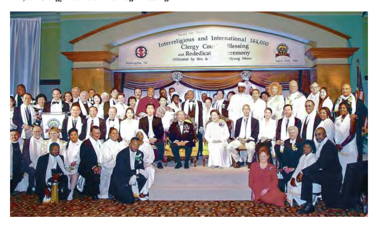
April 27, 2002 144,000 Clergy Interfaith Marriage Blessing