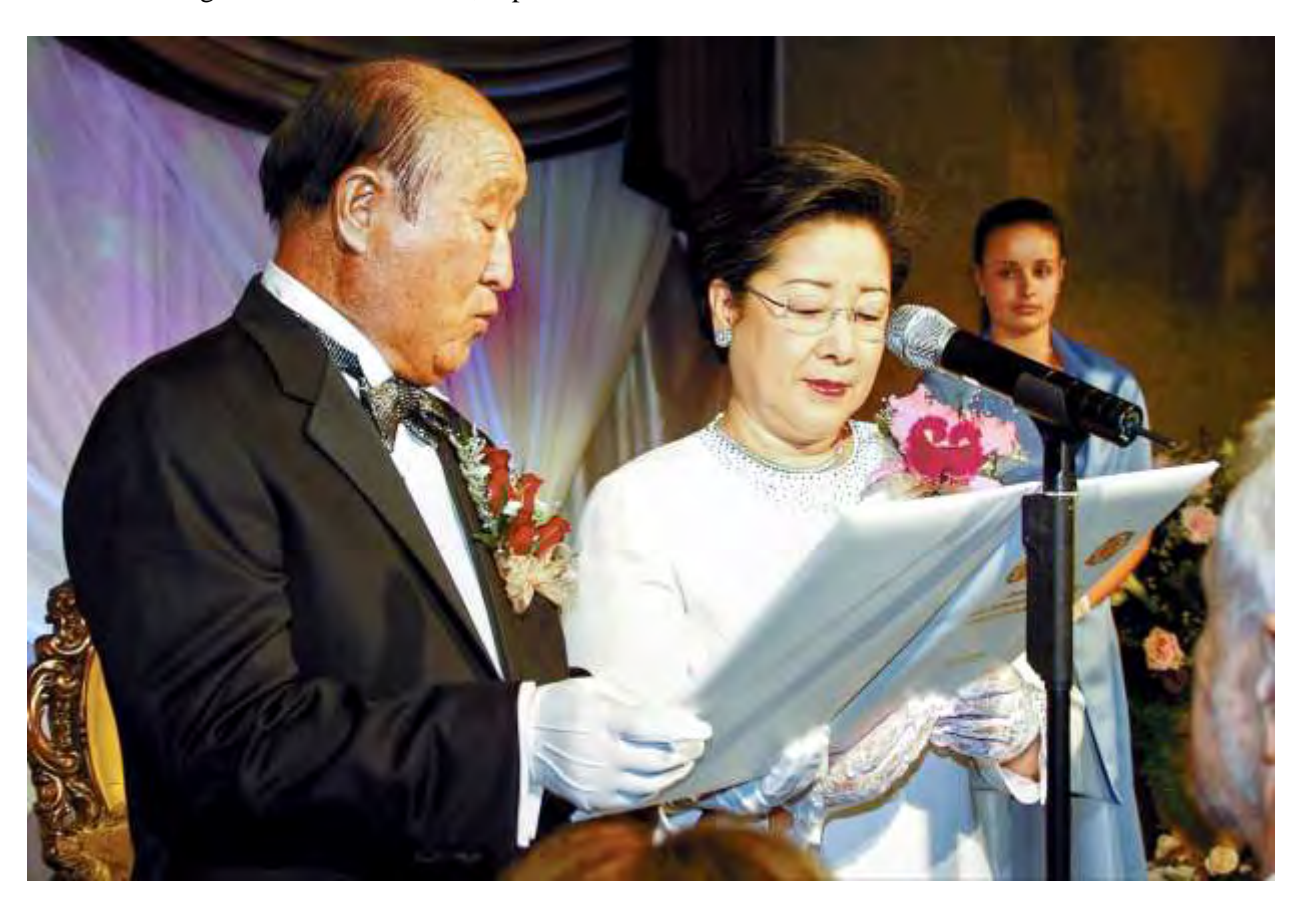
April 29, 2010 Coronation for the Establishment of the Abel UN and Luncheon Celebrating True Parents' Golden Wedding Anniversary

Arlington, Virginia, for some 700 representative clergy couples. Thousands of other couples participated in all 50 U.S. states and 196 nations via satellite connection. Commendations for the Blessing came from four U.S. governors and 25 members of Congress, including several U.S. senators. United Press International, Associated Press, ABC National, CBS local, The Washington Times and many Spanish-language and African-American newspapers covered the event. Religious leaders from every faith tradition offered prayers. Thirty couples came from the Nation of Islam, directly sent by the Honorable Minister Louis Farrakhan. Twenty-one Buddhist couples came from Korea. More than 21 Sikh leaders came from the Washington area. True Parents declared that the interreligious and international ceremony was a "total victory." Pastor T.L. Barrett Jr. from Chicago, who helped organize the event, declared, "Father [Moon] is a marrying man! He wants everything to be married. He would like a desk and chair or even the two light bulbs to be married, if possible."