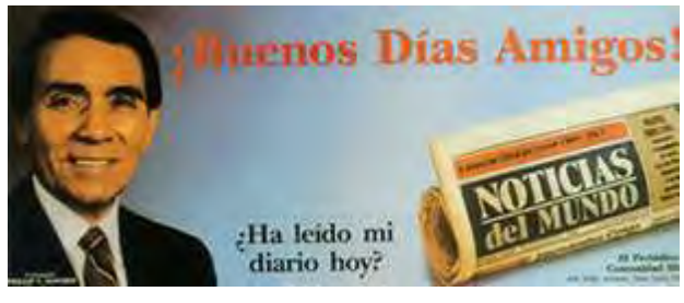
April 22, 1980 Noticias del Mundo Established