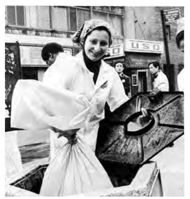
May 3, 1976 U.S. Members Clean Manhattan and the Bronx

True Father launched an "America the Beautiful" project on May 3, 1976, as part of the "God Bless America" campaign on the occasion of the United States' 200<sup>th</sup> anniversary. More than 1,000 Unificationists from across the nation took up brooms and dustpans to clean the New York City boroughs of Manhattan and the Bronx. Dressed in white jumpsuits with the God Bless America Festival logo on the back, they cleaned in their witnessing area every morning from 7 to 8. The cleanup project was intended to raise awareness for the upcoming "God Bless America Festival" at Yankee Stadium on June 1 at which True Father would deliver an address on "God's Hope for America." The Unificationist folk-rock band Sunburst provided free lunch-hour concerts, and hundreds of additional Unificationists arrived for the final push, spearheading street rallies and massive ticket distribution efforts.