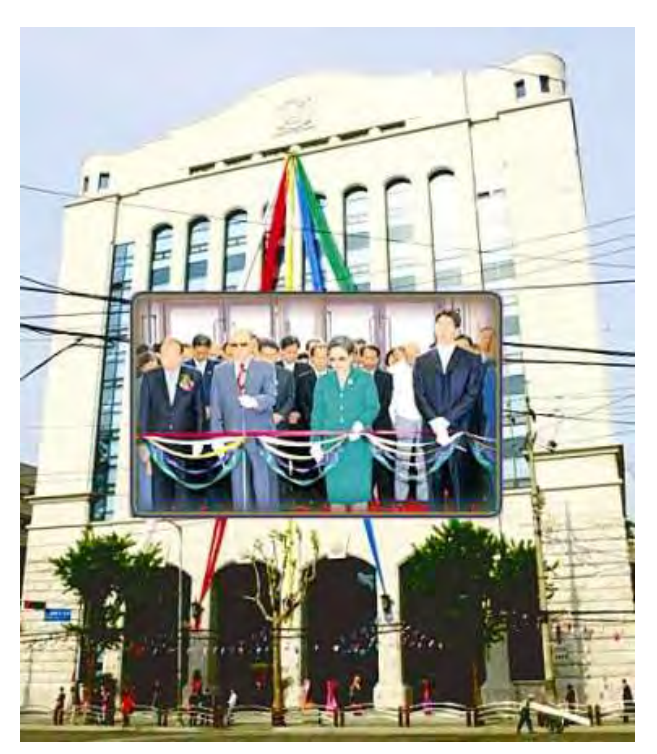
May 5, 2005 New FFWPU Headquarters Building Dedicated in Korea

The dedication ceremony for the new FFWPU Headquarters building was held on May 5, 2005, with the attendance of True Parents.