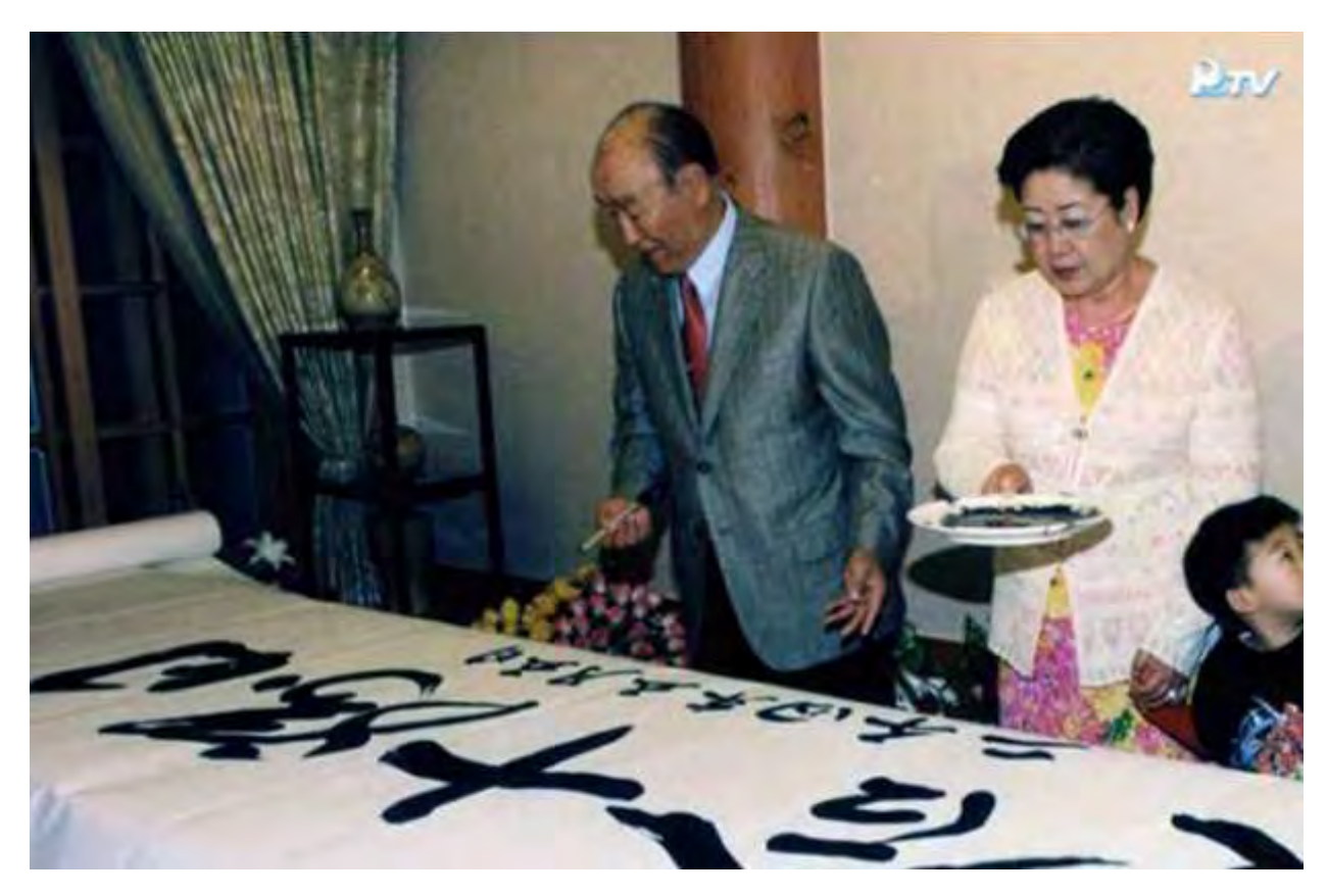
May 5, 2004 Declaration of a New Sabbath and "The Era after the Coming of Heaven"

True Father launched an "America the Beautiful" project on May 3, 1976, as part of the "God Bless America" campaign on the occasion of the United States' 200<sup>th</sup> anniversary. More than 1,000 Unificationists from across the nation took up brooms and dustpans to clean the New York City boroughs of Manhattan and the Bronx. Dressed in white jumpsuits with the God Bless America Festival logo on the back, they cleaned in their witnessing area every morning from 7 to 8. The cleanup project was intended to raise awareness for the upcoming "God Bless America Festival" at Yankee Stadium on June 1 at which True Father would deliver an address on "God's Hope for America." The Unificationist folk-rock band Sunburst provided free lunch-hour concerts, and hundreds of additional Unificationists arrived for the final push, spearheading street rallies and massive ticket distribution efforts.