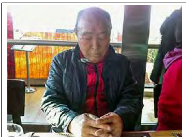
True Father in Las Vegas, praying for the safety of Japan after the earthquake

hundreds of thousands of residents in an 18-mile radius who were forced to evacuate. The World Bank's estimated economic cost was US $235 billion, making it the costliest natural disaster in world history.