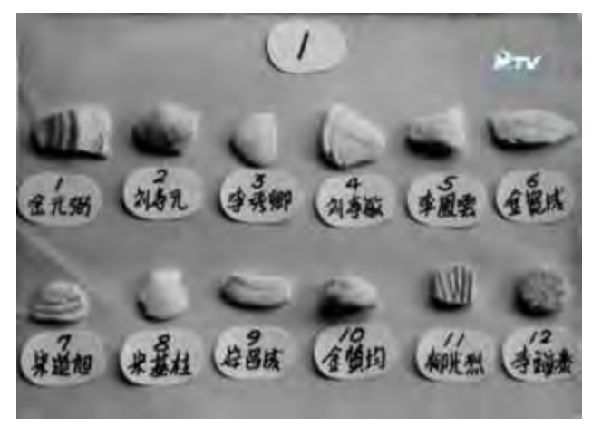
March 13, 1960 Decorative Stones Distributed at Cheongpadong Church