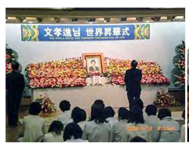
March 17, 2009 Hyo Jin Moon Ascends

True Father delivered the Pacific Rim speech in a "New Civilization" tour covering 24 cities in Korea during April and early May of 2007. True Mother delivered the same speech in 10 Japanese cities from May 2 to 11. The American portion of the tour continued through May and June. Unificationists subsequently held "New Civilization" rallies in their respective nations.