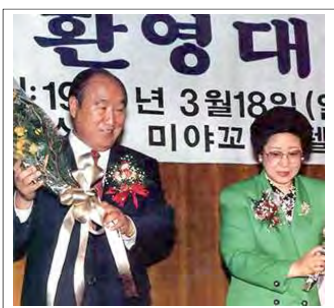
True Parents receive flowers at the San Francisco public speech to the Korean community on March 18, 1990.

True Father launched his first U.S. speaking tour since the 1970s, addressing Korean communities in five U.S. cities, beginning in San Francisco on March 17, 1990. The other cities were Los Angeles, Chicago, Washington, D.C., and New York, and True Father said the five cities represented the 50 states of America. True Father spoke on the topic "True Unification and One World."