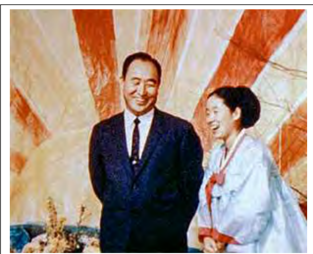
True Parents after officiating the 13 Couple Holy Marriage Blessing

On February 28, 1969, at the historic Upshur House in Washington, D.C., True Parents blessed 13 American couples, who according to some interpretations represented the original 13 colonies. This was the first Marriage Blessing Ceremony conducted outside Korea and the first of three that together came to be known as the 43 Couple Blessing. True Parents held a Marriage Blessing of 8 couples in Essen, Germany, on March 28, 1969, and a Marriage Blessing of 22 couples in Tokyo, Japan, on May 1, 1969. The 43 Couple Blessing was conducted on the foundation of the 430 Couple Holy Blessing conducted by True Parents in Korea the previous year and was intended to signify expansion to the worldwide level. True Parents celebrated the Blessing on the 20th day of their visit to the United States as part of their 1969