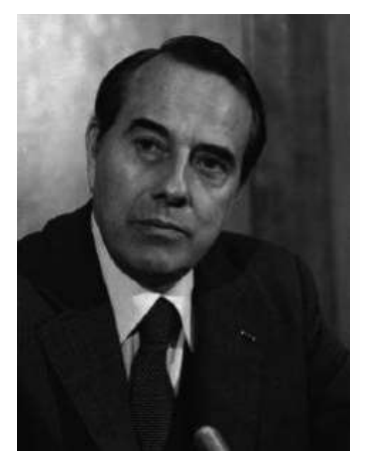
On February 18, 1976, anti-Unification movement organizations sponsored "A Day of Affirmation and Protest" in Washington, D.C., which included a two-hour presentation of grievances against the movement to U.S. Senator Robert Dole (R-Kansas) and representatives of seven U.S. government agencies. The "Dole hearing" provided critics of the Unification movement with a well-publicized, credible forum in which to air their grievances before important national-level figures.

February 18, 1976 Senator Robert Dole Convenes Anti-Unification Movement Investigation