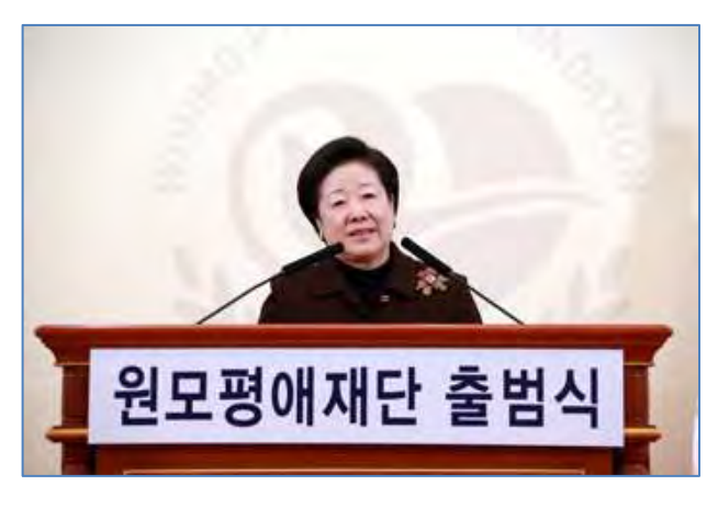
February 20, 2013 Wonmo Pyeongae Foundation Inaugurated

The Wonmo Pyeongae (Eternal Parent's Love) Foundation was officially inaugurated as a nonprofit foundation on February 20, 2013 (Korea time) at the Cheon Jeong Gung in Gapyeong, Korea, before an audience of approximately 1,000 people. True Father originally proposed the idea for the foundation in 2011.