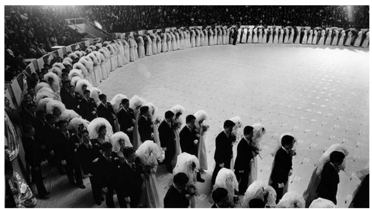
True Parents bless 1800 couples in marriage.

True Parents blessed 1,800 couples (technically, 1801) in what the Guinness Book of World Records then recorded as the largest mass wedding in history on February 8, 1975. The ceremony, conducted in Seoul's Jangchung Gymnasium, brought together couples from 25 nations, including 891 couples from Korea, 797 from Japan, 76 from the United States, 35 from European countries and two from the Republic of China. Over 10,000 guests witnessed the event, after which couples boarded ninety-four sightseeing buses for a parade through the streets of Seoul. True Parents blessed the 1,800 Couples 14 years after their Holy Marriage Blessing in 1960. It closed out the second 7-year or national-level course and opened the way to the Unification Church's international work. Some 300 members from the 1,800 Couples went out to 123 nations as foreign missionaries, pioneering the worldwide providence. True Father noted that 1,800 represents three times six, equaling eighteen or "the complete subjugation of the satanic number 6." The 1,800 Couples, he said, "represent all humankind." Upon their Blessing, he declared, "we enter the age to embrace the world." This year marks the 40th anniversary of the 1,800 Couple Blessing.