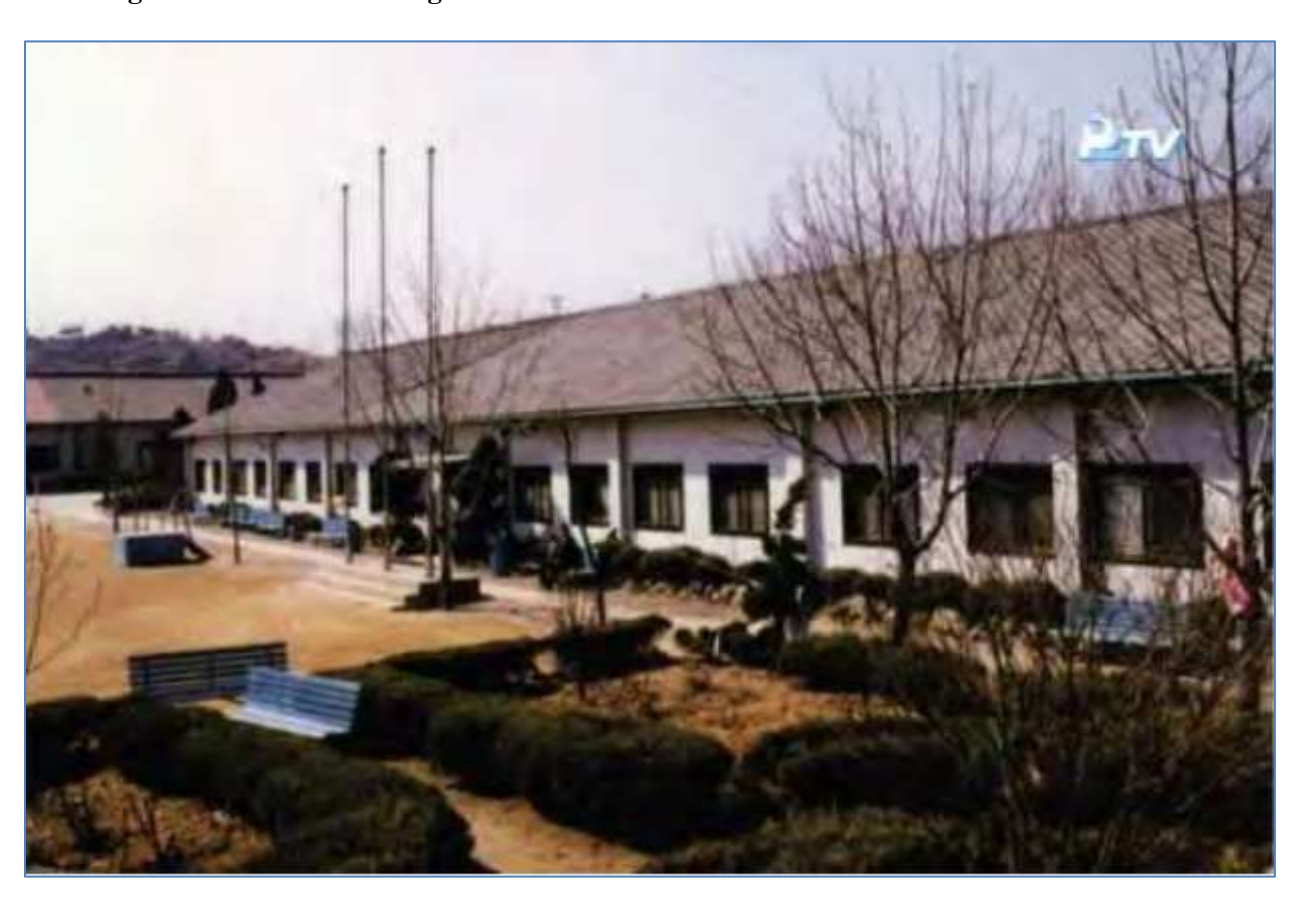
February 10, 1970 Founding of the Central Training Center

True Parents blessed 1,800 couples (technically, 1801) in what the Guinness Book of World Records then recorded as the largest mass wedding in history on February 8, 1975. The ceremony, conducted in Seoul's Jangchung Gymnasium, brought together couples from 25 nations, including 891 couples from Korea, 797 from Japan, 76 from the United States, 35 from European countries and two from the Republic of China. Over 10,000 guests witnessed the event, after which couples boarded ninety-four sightseeing buses for a parade through the streets of Seoul. True Parents blessed the 1,800 Couples 14 years after their Holy Marriage Blessing in 1960. It closed out the second 7-year or national-level course and opened the way to the Unification Church's international work. Some 300 members from the 1,800 Couples went out to 123 nations as foreign missionaries, pioneering the worldwide providence. True Father noted that 1,800 represents three times six, equaling eighteen or "the complete subjugation of the satanic number 6." The 1,800 Couples, he said, "represent all humankind." Upon their Blessing, he declared, "we enter the age to embrace the world." This year marks the 40th anniversary of the 1,800 Couple Blessing.