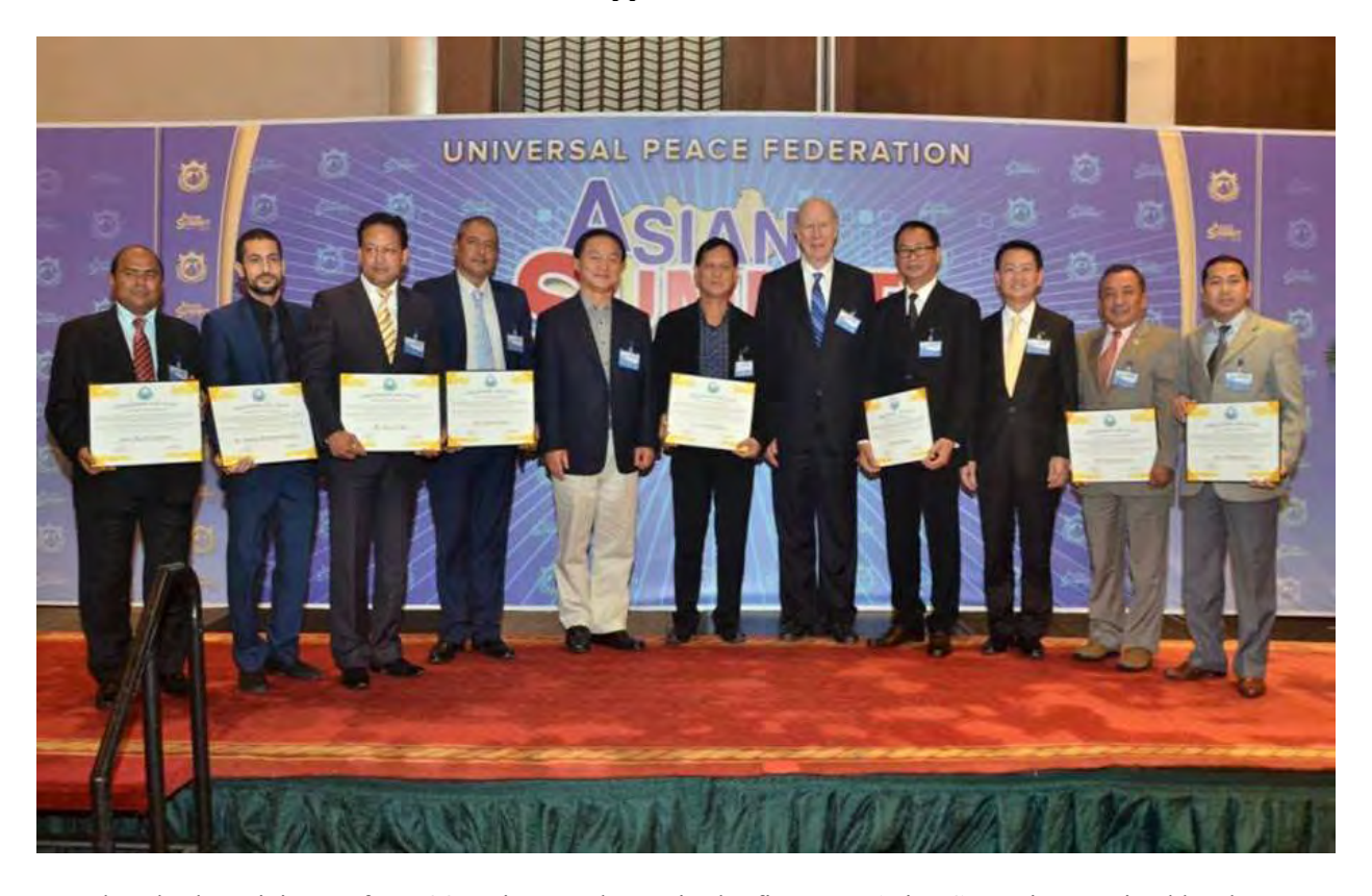
January 30, 2015 First UPF Asian Summit Is Held in the Philippines

Four hundred participants from 28 nations took part in the first ever Asian Summit organized by the Universal Peace Federation (UPF). The summit, titled "Toward Peace, Security and Human Development in the Asia Pacific Region," was held in the Manila Hotel in Manila, Philippines, from Jan. 30 to Feb. 1, 2015.