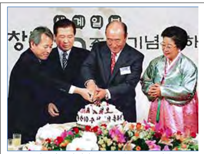
True Father founded the Segye ("universal") Times to be the "window on the world" for the Korean people.

In 1988, following South Korean President Roh Tae-woo's declaration of greater freedom and the Seoul Olympics, the number of newspapers in Korea doubled. True Father founded the Segye ("universal") Times . He intended it to be the "window on the world" for the Korean people. According to True Father: