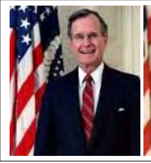
Reagan-Bush I (1981-92) - Republican

The Unification movement did not fare well during the Carter years. Following the victorious 1976 Washington Monument rally, Rev. Moon expected the American movement to increase its membership to 30,000 and spearhead a "march on Moscow" by 1981. Instead, kidnappings and "deprogramming" of members continued, sometimes sanctioned by court order, and the movement found itself increasingly on the defensive, caught up in government investigations and legal battles. This blunted the movement's advance and led to what Rev. Moon described as a "prolongation" of the providence.