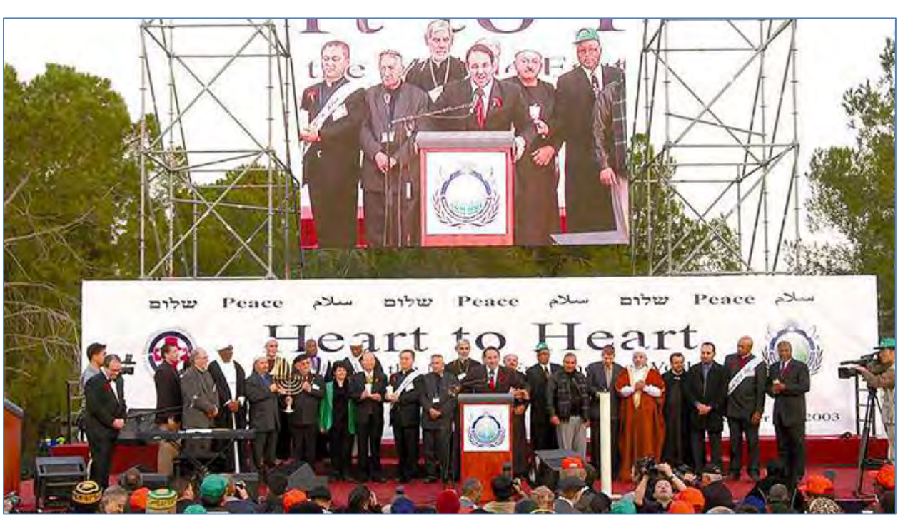
A rally was held at Jerusalem's Peace Park

True Parents set important conditions, centered on the American Clergy Leadership Conference (ACLC), for the reconciliation of the Abrahamic faith traditions of Judaism, Christianity and Islam. In 2003, True