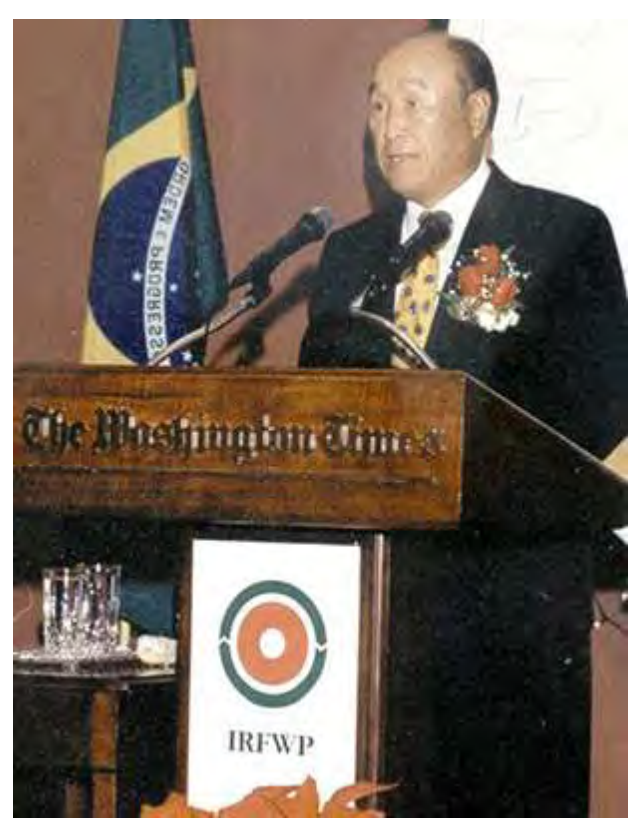
True Father speaks at the IRFWP conference

Realizing the Interfaith Ideal: Action Beyond Dialogue