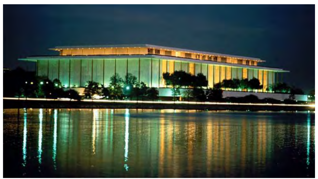
The Kennedy Center is where the Little Angels performed the day they greeted True Father in Washington, D.C.