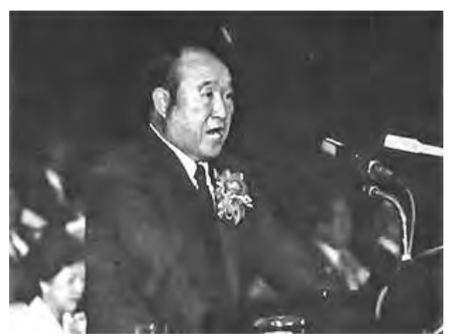
True Father delivers the Citizens' Federation Founder's Address

The "Danbury Course" was decisive in sparking widespread grassroots support for True Father across the United States from minority communities and those concerned about religious and civil liberties. In fact, a broad spectrum of 1,600 clergy and prominent laypeople welcomed True Father back from prison at a "God and Freedom" banquet held in his honor at the Omni Shoreham Hotel in Washington, D.C. A similar event occurred in Korea on December 11, 1985, when some 2,300 dignitaries from a diversity of fields, including a former prime minister of the Republic of Korea, attended a welcoming banquet at the Hilton Hotel Convention Center to pay tribute to the conclusion of True Father's 40-year ministry and to welcome him back to his homeland.