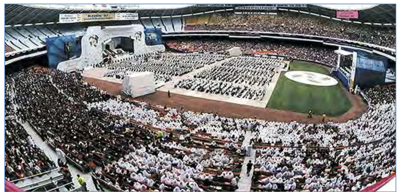
An aerial view of the 3.6 Million Couples' Marriage Blessing Ceremony

True Parents conducted the 3.6 Million Couples' Holy Marriage Blessing Ceremony at Washington, D.C.'s Robert F. Kennedy (RFK) Stadium on November 29, 1997. This was the first major Blessing in the United States since 1982 and was an exponential leap beyond the Holy Blessing of 360,000 Couples at Seoul Olympic Stadium in 1995. The 1997 Blessing was conducted within the context of the third World Culture and Sports Festival (WCSF) from November 23-30. Under the theme, "Rebuilding the Family, Restoring the Community, Renewing Washington," WCSF III featured an array of conferences, sports competitions, concerts, recitals and service projects all of which culminated with the Blessing, billed as "True Love Day at RFK." Couples bussed in from as far away as Chicago. The Washington Post set attendance at 40,000, CNN at 45,000 and the Associated Press at 56,000. Other couples took part by "satellite Blessing" at locations throughout the world.