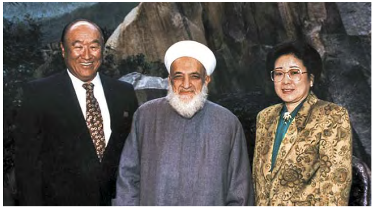
True Parents and the Grand Mufti of Syria

Unknown to most, Unificationists had cultivated contacts within the Muslim world since the early 1980s. While conventional mission work was exceedingly difficult, the Middle East Times gave the movement a presence in the region. In addition, the Professors World Peace Academy (PWPA) held a series of six highly successful conferences that brought together Arabs, Israelis, Greeks, and Turks on a variety of topics. On the foundation of these meetings, the Council for the World's Religions convened several conferences of high-level Muslim religious leaders, including the grand muftis of Syria and Yemen.