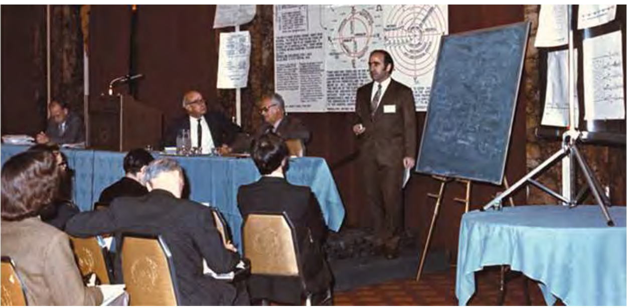
A session from the first ICUS conference

The First International Conference on Unified Science (later renamed the International Conference on the Unity of the Sciences, or ICUS) was held at the Waldorf-Astoria Hotel in New York City from November 23-26, 1972. It convened twenty scientists from seven nations to discuss "Moral Orientation of the Sciences."