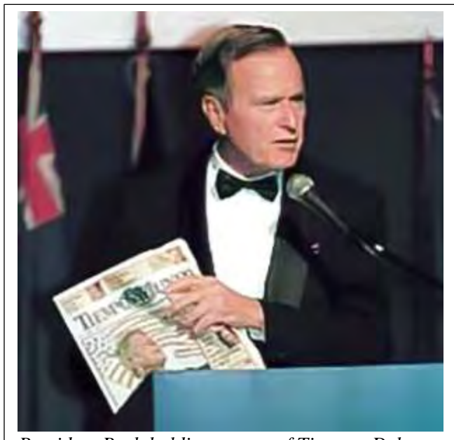
President Bush holding a copy of Tiempos Del Mundo at its inauguration

True Parents unveiled Tiempos del Mundo, the first inter-American Spanish-language newspaper at the Buenos Aires Sheraton on November 23, 1996. With publication beginning as a weekly in Buenos Aires, plans called for the newspaper to come out on Sundays at first, but go daily very quickly via satellite transmission to editorial centers in 17 countries (10 in South America, five in Central America and one in the Caribbean and the United States). At the gala evening inauguration attended by 300 leaders from 33 Latin American nations plus more than 600 local VIPs, former U.S. President George Bush stated, "I want to salute Rev. Moon, who is the founder of The Washington Times and also of Tiempos del Mundo. ... A lot of my friends in South America don't know about The Washington Times, but it is an independent voice. The editors of The Washington Times tell me that never once has the man with the vision interfered with the running of the paper, a paper