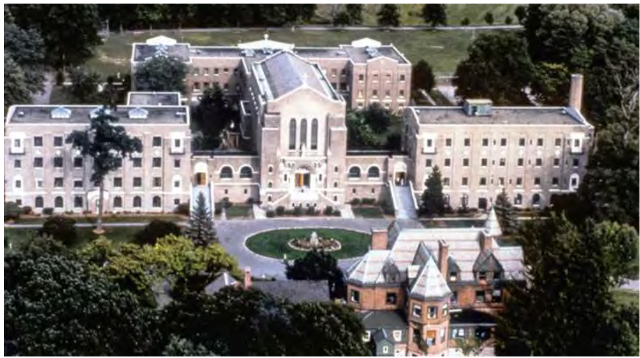
An aerial view of UTS

Unification Theological Seminary obtained a "provisional charter" to grant academic degrees on November 21, 1986. By a 12-2 vote, the New York State Board of Regents approved the Seminary's provisional charter and master plan. UTS graduates would now receive master's degrees in either Religious Education (M.R.E.) or Divinity (M.Div.). This action marked the end of a 10-year battle to attain recognition. A previous attempt to gain a provisional charter, submitted in 1976, was denied in 1978. UTS took the matter to court, claiming discrimination and unfair treatment, narrowly losing a 4-3 decision of the New York State Court of Appeals in 1981. Reapplication for the charter was made in April 1984. Some 450 students who had attended UTS prior to 1986 graduated with "certificates" rather than degrees. It would be another four years before the State of New York granted UTS its "Absolute Charter," some 15 years after its initial application.