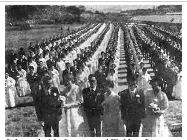
Rehearsal of the International Wedding Ceremony of 777 couples at Sutaek Ri.

True Parents presided over the first truly international Marriage Blessing Ceremony when they blessed 777 couples on October 21, 1970. As part of the 430 Couples Holy Marriage Blessing in 1968, True Parents blessed 43 non-Korean couples overseas in 1969. For the 777 Couples Holy Marriage Blessing, participants came from 10 nations to Korea. The Marriage Blessing was conducted at Seoul's Changehung (Metropolitan) Gymnasium in the presence of over 15,000. True Father stated that this was the last Marriage Blessing that he would conduct "before globalizing my mission." He noted that the 777 Couples Holy Marriage Blessing was the seventh following True Parents' Holy Wedding. This Marriage Blessing lay the foundation for the Unification movement to