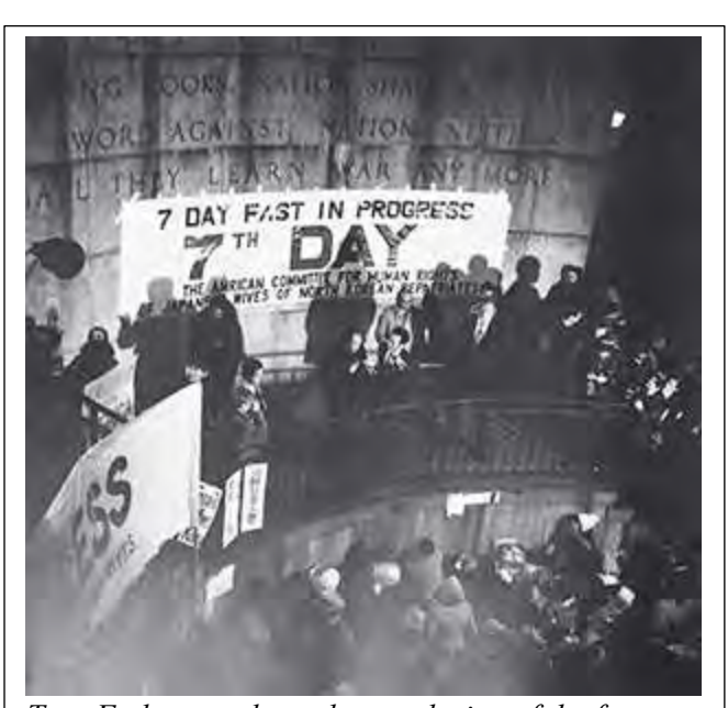
True Father speaks at the conclusion of the fast

Seven hundred Unificationists fasted for seven days in front of the United Nations in New York from October 21-27, 1974, to protest the treatment of Japanese wives of North Korean repatriates. True Father initiated the fast for humanitarian and providential reasons. He noted that Korean men living in Japan who married Japanese women and then repatriated to North Korea had "cheated" the wives who were "now ill-treated and persecuted under the regime." In this connection, the Unification Church published a volume of testimonies from these women, If I Had Wings Like a Bird, I Would Fly Across the Sea, which publicized their plight. Apart from the humanitarian issue, Unificationists undertook the fast within the context of a North Korean proposal, which had gained traction in the UN General Assembly, that called for UN forces to be removed from South Korea. True Father stated that the fast's