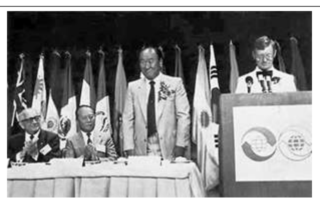
In its sixth year, the World Media Conference, held in Cartagena, Colombia, was the largest and most successful gathering in its history.

Having experienced the "awesome power" of the media "to create or to destroy," True Father established the World Media Association to advance the cause of world peace by championing freedom and moral responsibility in the press. The association convened the first World Media Conference in October 1978 at the Waldorf-Astoria Hotel in New York, under the theme "The Future of the Free Press." Thirty-eight journalists from 16 countries participated. The association continued to sponsor World Media Conferences and associated "fact-finding" tours for journalists throughout the 1980s. The sixth conference, held in Cartagena, Colombia, in September 1983, brought together