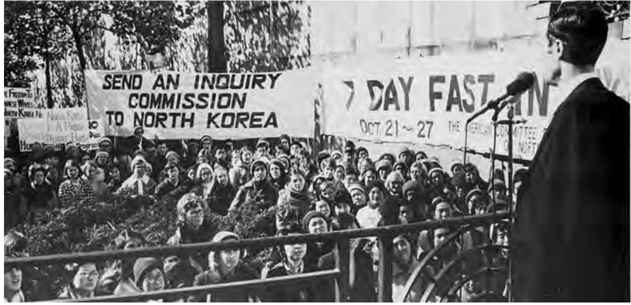
Protestors hold a 7-day fast on behalf of wives in North Korea.