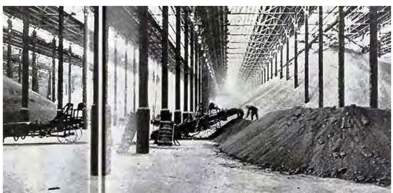
The work and storage room at the Hungnam Labor Camp.

special feature of the Blessing this time was that people born into the Unification Church were given the freedom to select their spouse by themselves in front of True Parents.