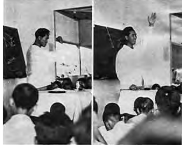
True Father teaching at Cheongpa Dong

Three days after True Father's release from Seodaemun Prison, the church borrowed 2 million won to purchase an abandoned building in poor repair on a hillside in Cheongpa Dong, Seoul. It reportedly had been a small Japanese Buddhist temple during the colonial era and one of many houses categorized as "enemy property." This was the first property purchased by the Unification Church, which previously had occupied rented space, and served as its headquarters for the next 20 years. The Cheongpa Dong Church was the site of True Parents' engagement and Holy Wedding ceremonies as well as the 36 and 72 Couples' Holy Wedding ceremonies. It was also where the earliest editions of the Divine Principle were distributed and served as True Parents' residence, where True Father planned much of the movement's worldwide mission.