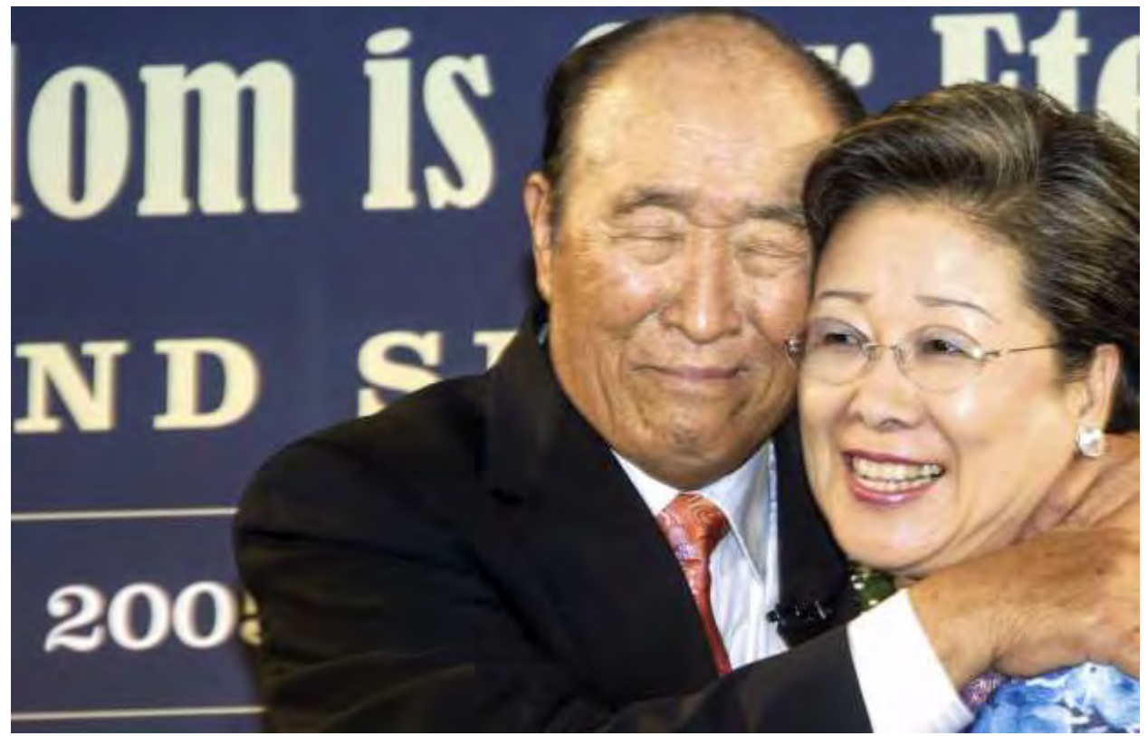
rue Parents at the inauguration of the Universal Peace Federation on September 12, 2005