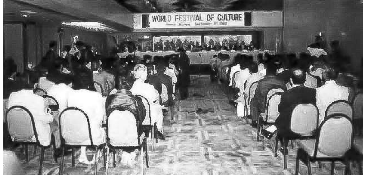
The press conference announcing the World Festival of Culture