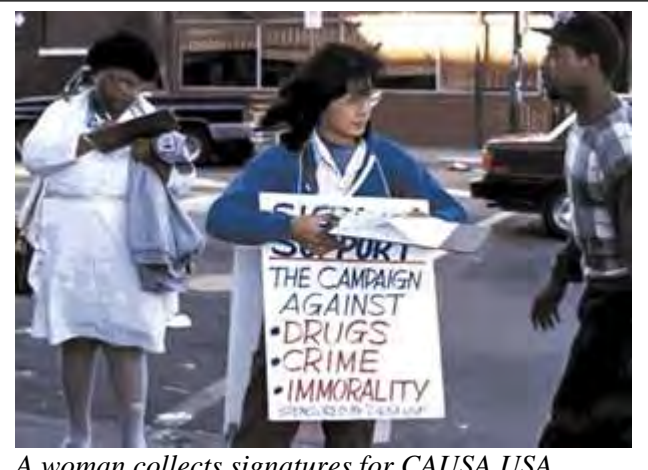
September 1, 1986 CAUSA 10 Million Signature Drive

A woman collects signatures for CAUSA USA