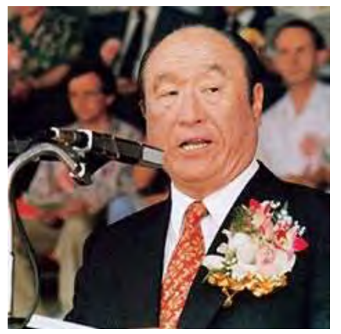
July 6, 1992 True Father Publicly Declares His Messiahship

True Father publicly declared his messiahship for the first time in a speech delivered to Women's Federation for World Peace (WFWP) and Korean civic leaders in Chungju, Korea. This was the first of four major gatherings that took place from July 6 to 9, 1992, in Korea's Seoul region, the southeast region, the southwest region and the mid-Korea region. In his speech, "The Reappearance of True Parents and the Ideal Family," True Father stated: