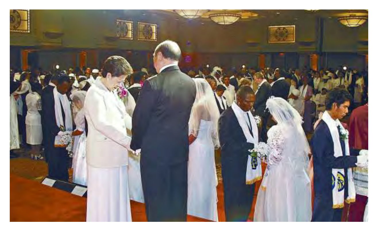
July 3, 2002 Holy Blessing of 1,440,000 Second Generation Christian Youth and World Religious Youth

True Parents officiated at a series of Interfaith Marriage Blessings centered on the American Clergy Leadership Conference (est. 2000) and the ACLC's "We Will Stand in Oneness" 50-state speaking tour (2001).