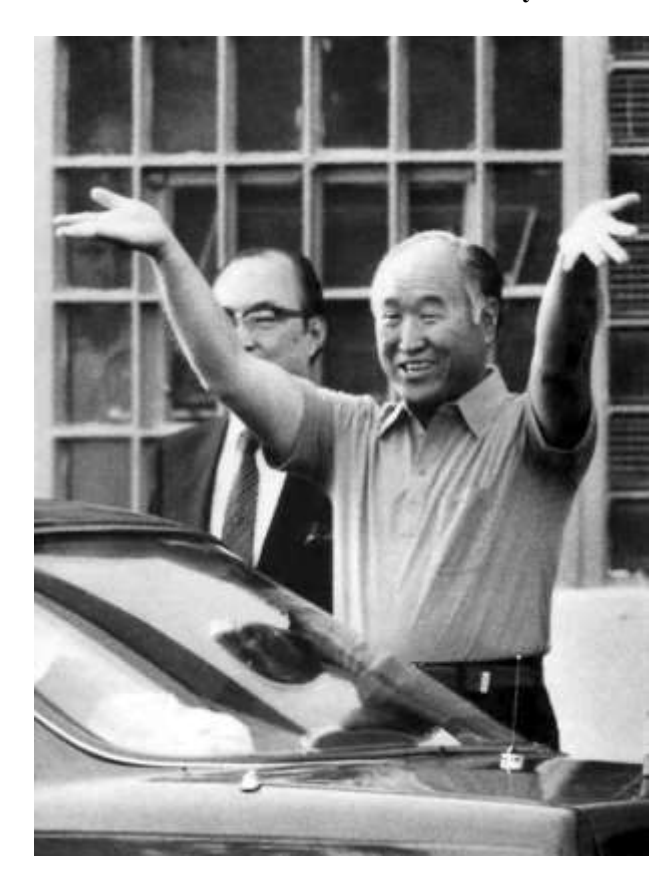
July 4, 1985 True Father Transferred from Danbury to Phoenix House

After serving nearly 12 months in Danbury Federal Correctional Institution in Connecticut, True Father was transferred to Phoenix House, a halfway facility in Brooklyn, New York, where he served the final 45 days of his 18-month sentence, getting five months off for good behavior. True Father was permitted to leave the house at 7:00 a.m. each morning and was required to return by 11:00 p.m. During the day he was free to direct church affairs.