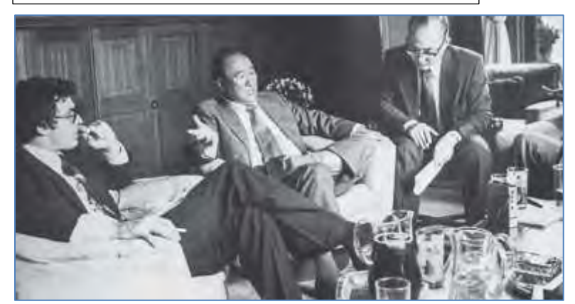
True Father being interviewed for the Newsweek magazine article