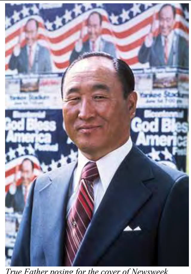
True Father granted an interview to Newsweek International's executive and general editors. Excerpts from their three-hour conversation were published as part of a cover story on the Unification Church.

In the interview, True Father explained the origins of the Unification Church and its mission, saying: "My new revelation has made the Will of God crystal clear. And what is that Will? It is to save the world. So the Unification Church is not another denomination—it's a movement to save the world, and through the teaching of the word of God, each individual in our movement becomes absolutely clear about the concept of the God-centered individual, the God-centered family, the God-centered nation and the God-centered world."