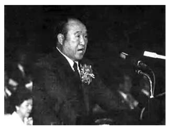
May 15, 1987 Citizens Federation for the Unification of the Fatherland Inaugurated

True Father inaugurated the Citizens Federation for the Unification of the Fatherland (CFUF) at the Little Angels Performing Arts Center in Seoul, Korea, on May 15, 1987. Its purpose was to facilitate the long-cherished hope and desire of the Korean people for the unification of their homeland. However, True Father viewed the reunification of Korea in larger terms: "Korea's problems are a smaller version of the world's problems, and the solution of the world's problems is essentially linked with Korea's problems." In particular, he saw the division of Korea as a manifestation of a global confrontation between theism and atheism. The solution to the problem