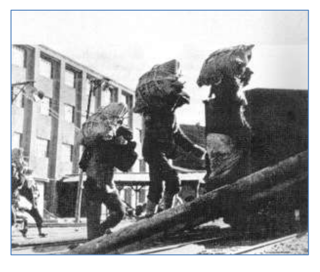
May 20, 1948 True Father Enters Hungnam Prison

After being arrested for the second time in North Korea on February 22, 1948, True Father was charged with being a spy for the South and for disturbing the social order. Some 80 Christian ministers who had lost members to True Father's group precipitated this action by writing letters to the police. True Father was once again tortured and wrote later, "My body still carries several scars that I received then." He went on trial on April 7 and was convicted. He wrote in his autobiography, "Many of the most famous ministers in North Korea came to the courtroom and accused me of all manner of crimes." That day he was taken to Pyongyang Prison where he remained until he was transported to Heungnam on May 20, nearly three months following his arrest. True Father wrote, "I