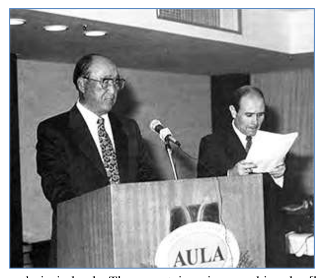
May 16, 1995 True Father Begins a 17-Nation Speaking Tour in South America

True Father believed that the unity of North and South America was a providential necessity that would set a condition for the unification of North and South Korea. To that end, he launched CAUSA activities in Latin America during the 1980s and began investing directly in South America during the 1990s. Beginning on May 16, 1995, True Father undertook an ambitious speaking tour of 17 Latin American nations, which included audiences with eight heads of state. In these speeches and meetings he emphasized the region's "stunning, and abundant, potential." As he put it: "There are seemingly unlimited natural resources, and the human energies have hardly begun to be tapped. Latin America is a rich, peaceful, natural paradise of grandiose mountains