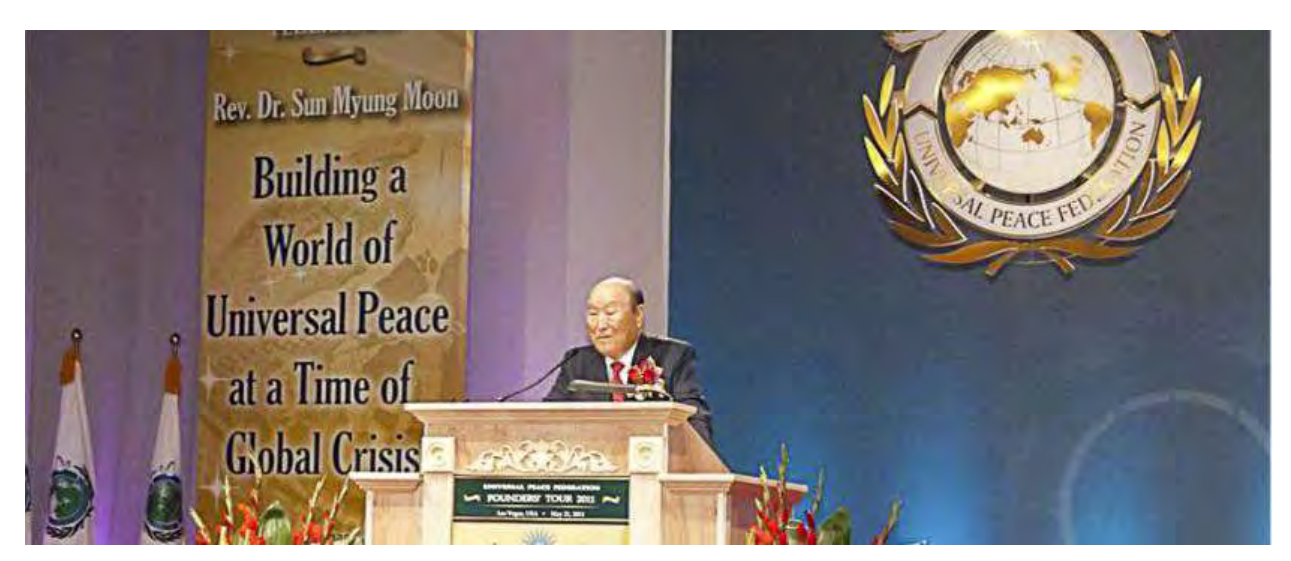
May 21, 2011 True Father Concludes 2011 World Peace Tour in Las Vegas

True Father conducted his final world tour, a World Peace Tour of ten nations in 28 days, traveling 28,000 miles at age 91. He spoke in Seoul, Korea; Madrid, Spain; Rome, Italy; Oslo, Norway; Athens, Greece; Istanbul, Turkey; London, England; Geneva, Switzerland; and Berlin, Germany. His final and only U.S. stop was in Las Vegas on May 21. There, he told an international audience of over 3,000 in the Aria City Center that God had great expectations for the long-notorious gaming capital of the world, that it will soon gain a new reputation as a "city of giving." In support of that, True Parents sponsored a charity slot tournament at the Aria Resort the morning of the event for 300 participants with proceeds from the $500 entry fee going to local charities. True Father envisioned each stop of the tour as an interreligious assembly and representatives of faith bodies were prominent participants.