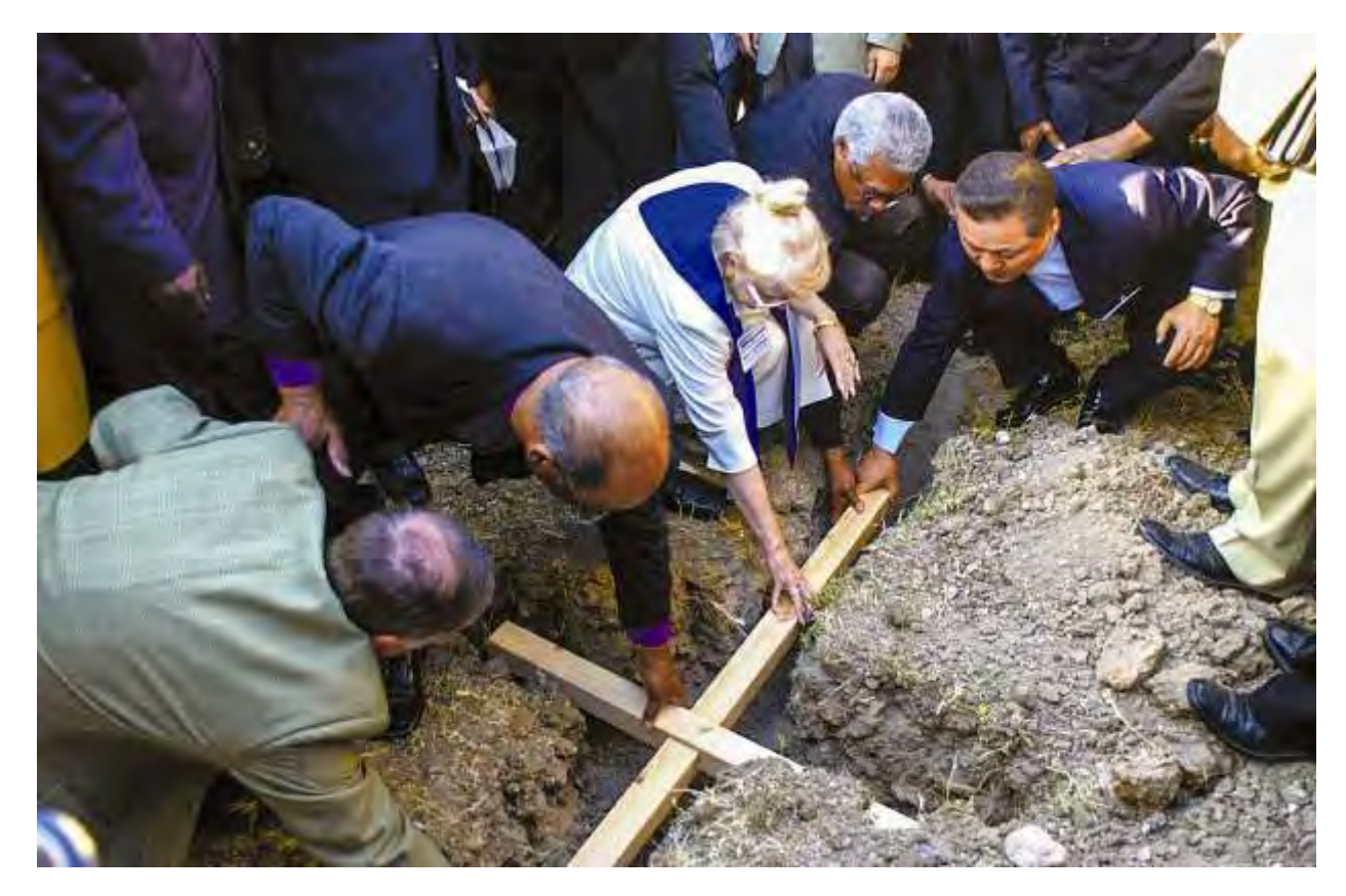
May 18, 2003 Clergy and Rabbis Sign the Jerusalem Declaration

May 18, 2003, was a momentous day of the first Middle East Peace Initiative (MEPI) Holy Land Peace Pilgrimage. U.S. clergy awoke early and left their hotel in busses at 5:30 a.m. to go to the Church of the Holy Sepulcher. It was fortunate they left at this time because at 6:00 a.m. a suicide bomber set off a blast two blocks from the hotel, killing seven people and injuring 22. All traffic was stopped and had the clergy left any later, they would not have been able to pass. From there, they offered a 30-minute service at the site of Golgotha and then traveled a mile or so to the Potter's Field, also referred to as the Field of Blood, which, according to Matthew 27, the chief priests purchased with the 30 pieces of silver Judas got for betraying Jesus. Pastors lifted a wooden cross, about six feet high, as they marched down a winding road to the Potter's Field. At the site, ministers placed the cross in a hole previously dug to its exact dimensions by Israeli FFWPU members. They placed a FFWPU flag, "dated and signed by representative leaders," on top. The ceremony concluded with participants putting "soil on the cross one-by-one, repenting for the false faith" that was "preventing Christianity and Judaism from achieving reconciliation."