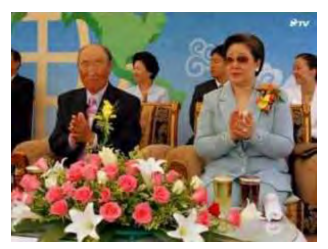
May 21, 2004 Rally for the Declaration of Absolute Values for the Sake of Harmony and Unification

On May 21, 2004, the Rally for the Declaration of Absolute Values for the Sake of Harmony and Unification occurred at Blue Sea ( Cheonghae ) Garden, Yeosu, in South Jeolla Province. True Father spoke under the title "The Purpose of True Love, Harmony and Unity Is the Perfection of the Absolute Values of True Families" in front of 13,000 people at the Blue Sea Garden plaza, revealing that a family attains perfection through the absolute values of true love. On this day, 450 participants from seven nations established sisterhood relationships with 450 Korean participants, and those present determined to carry out peace endeavors for harmony and unity through a sibling love