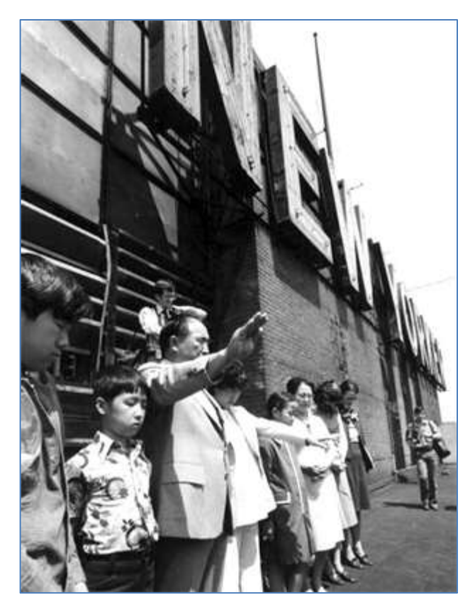
May 13, 1976 The New Yorker Hotel Purchased

The Unification Church purchased the New Yorker Hotel at Eighth Avenue and 34th Street in the New York City borough of Manhattan on May 13, 1976. The 43-story, 1,083-room hotel, which first opened in 1930, is near Pennsylvania Station, Madison Square Garden, Times Square and the Empire State Building. Much like its contemporaries the Empire State Building (1931) and the Chrysler Building (1930), the New Yorker was designed in the Art Deco style popular at the time. When the 1 million-square-foot hotel opened, it contained 2,500 rooms, making it the city's largest for many years and one of the most fashionable during the 1940s and 1950s. A pronounced decline in New York's fortunes in the late 1960s and early 1970s, coupled with the construction of new, more modern hotels, caused the New Yorker to become unprofitable, and it was vacant for several years before being purchased by the church for a reported $5.6 million. It served as the Unification Church's World Mission Center from 1976 to 1994. In 1994, the church converted a portion of the building to use as a hotel again. The New Yorker joined the Ramada chain in 2000 and the