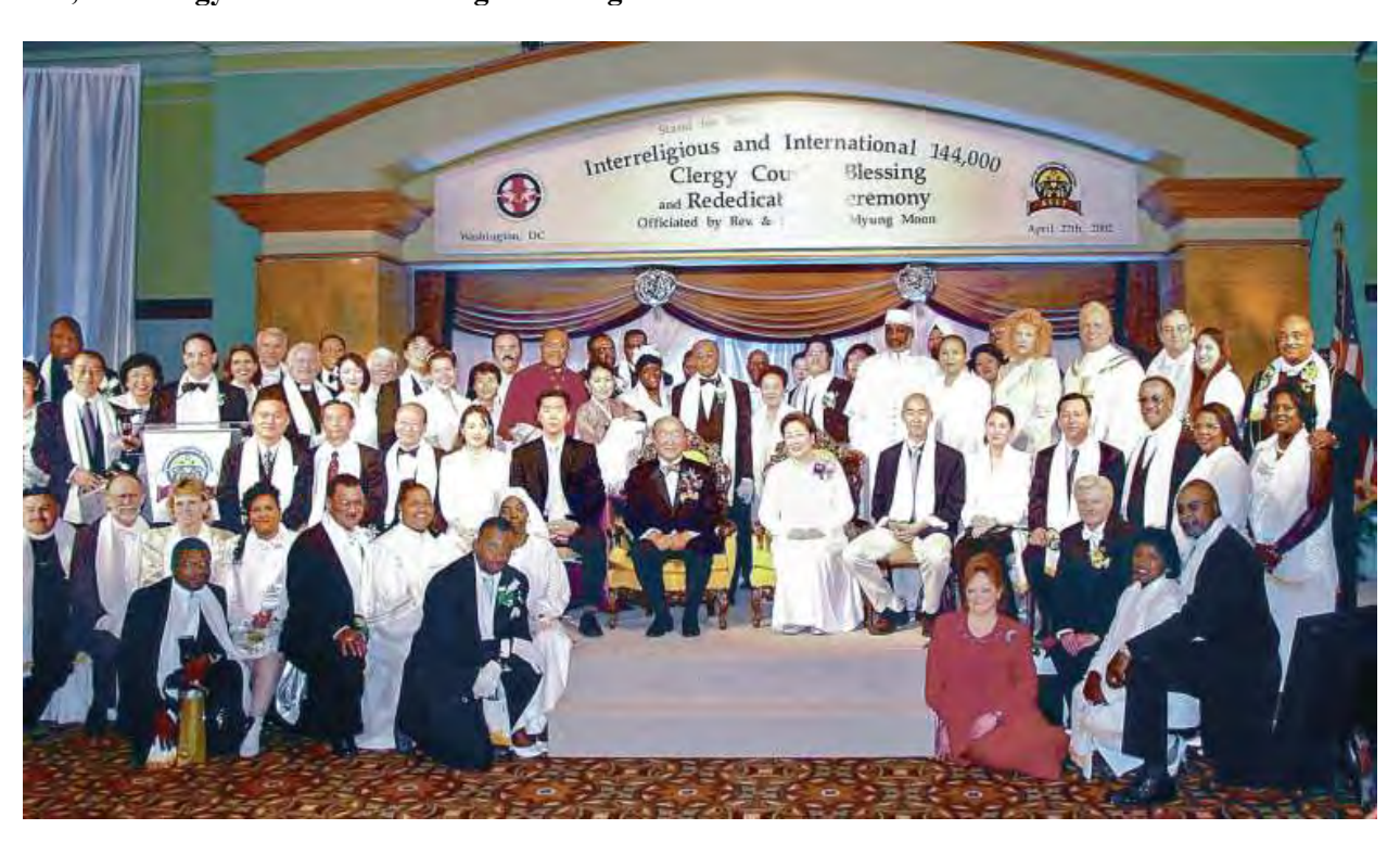
April 27, 2002 144,000 Clergy Interfaith Marriage Blessing