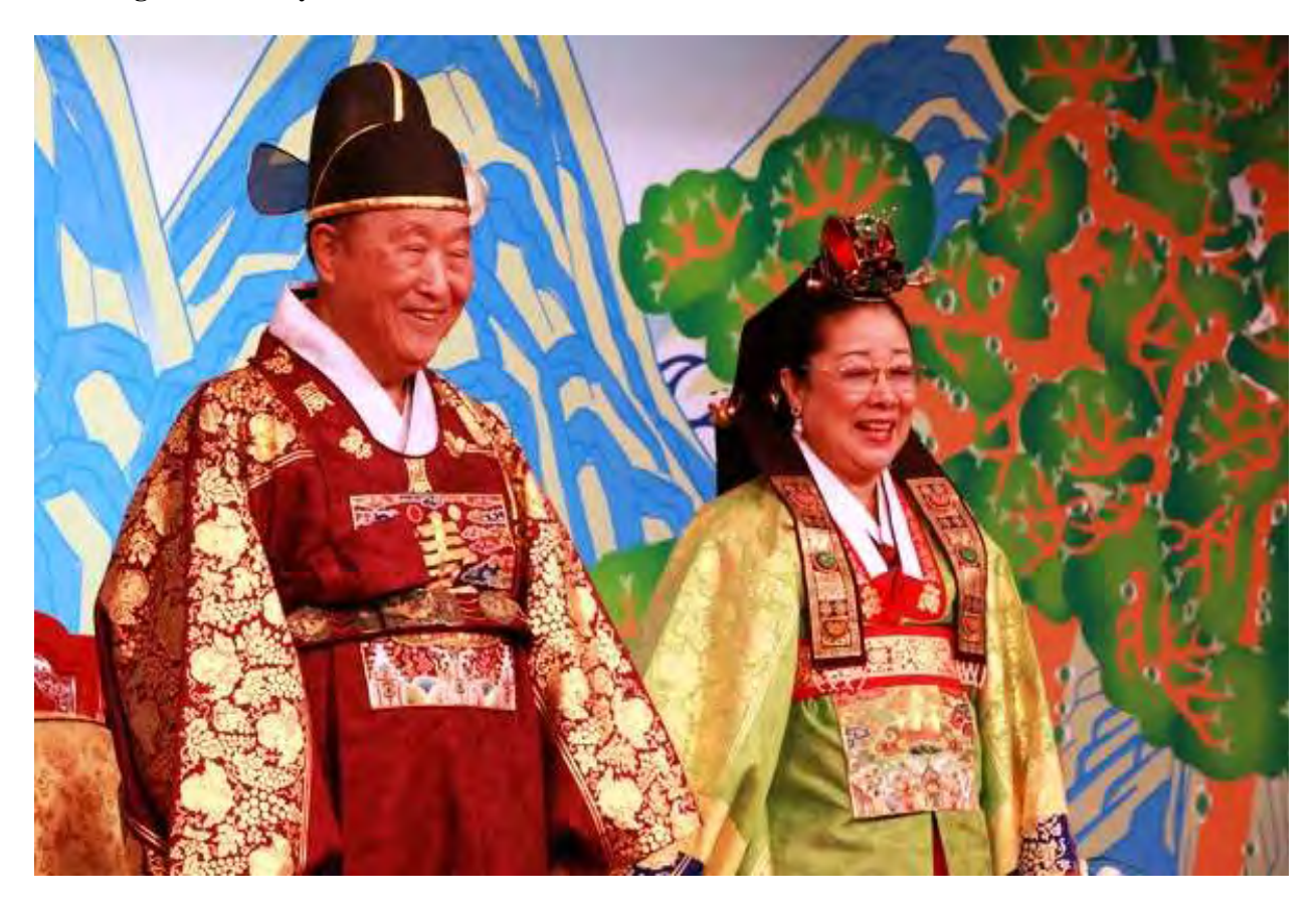
On the foundation of "Legacy of Peace" ceremonies held at the UN headquarters (March 18) and in