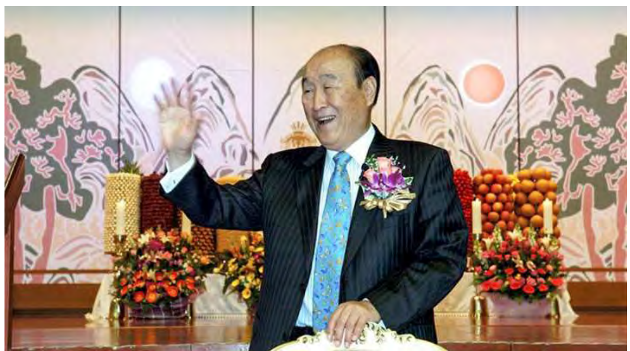
True Father at the 47th True Parents' Day celebration

Parents' Day was the first Holy Day established in the Unification tradition. True Father established it on April 10, 1960 (March 15, according to the lunar calendar). Unificationists observe Parents' Day—now designated as True Parents' Day—on the first day of the third month of the Heavenly Calendar. The establishment of Parents' Day followed True Parents' engagement on March 27, 1960. It signified that God had finally established His first son and daughter as the True Parents of humankind. True Father later stated, "Parents' Day is the first time since God created all things and humankind that there is one balanced man, one balanced woman, balanced in love, to whom God can descend and with whom He can truly be." Following Parents' Day, True Father established Children's Day (1960), Day of All Things (1963) and God's Day (1968) as Holy Days. They were set up to celebrate the emergence of the True Family and the foundation upon which a new world can take shape and a new history begin.