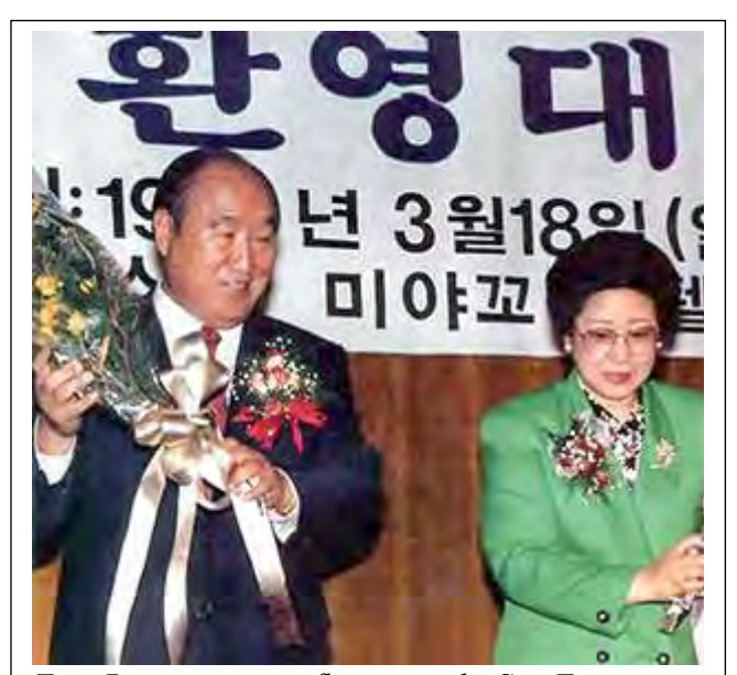
True Parents receive flowers at the San Francisco public speech to the Korean community on March 18, 1990

True Father launched his first U.S. speaking tour since the 1970s, addressing Korean communities in five U.S. cities, beginning in San Francisco on March 17, 1990.