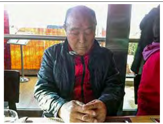
True Father in Las Vegas, praying for the safety of Japan after the earthquake

A 9.0 magnitude undersea earthquake approximately 43.5 miles off the Japanese coastline on March 11, 2011, triggered a powerful tsunami, with waves reaching heights of up to 133 feet, which, in the area of the city of Sendai, traveled up to 6 miles inland. Referred to in Japan as the Great East Japan Earthquake, it was the most powerful earthquake ever recorded to have hit Japan, and the fourth most powerful earthquake in the world since modern record-keeping began in 1900. The earthquake moved Honshu (the main island of Japan) 8 feet eastward and shifted the Earth on its axis by between 4 and 10 inches. A Japanese National Police Agency report confirmed 15,889 deaths, 6,152 injured, and 2,601 people missing across twenty prefectures,