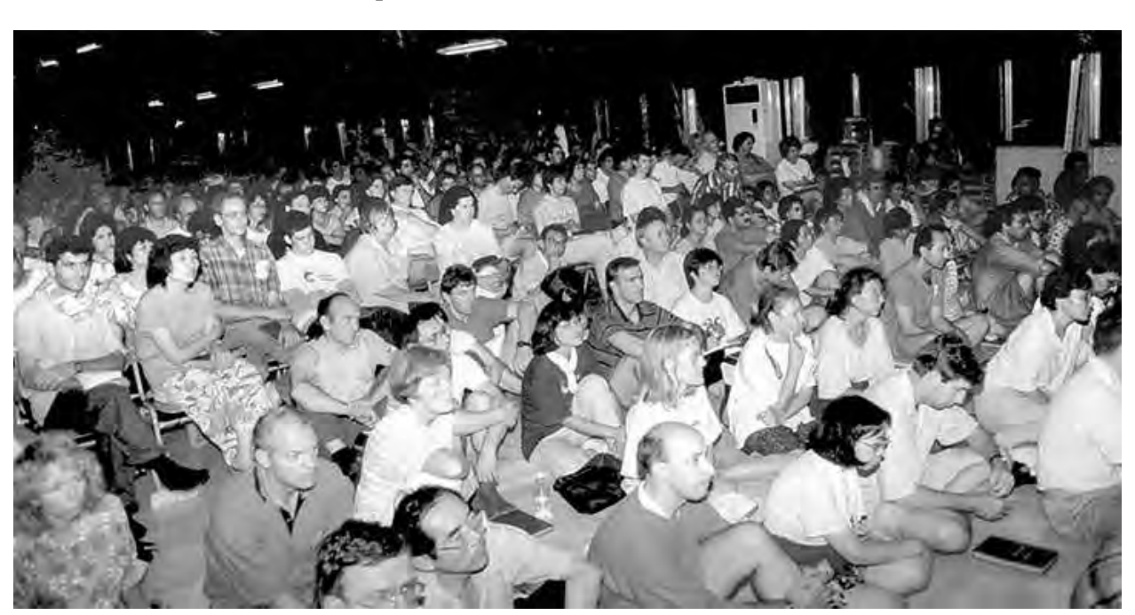
March 12, 1996 First National Messiah Workshop

As a major center of world Unificationism, the Japanese Unification Church was directly impacted by the tsunami. In the immediate aftermath, there were reports of two confirmed deaths. However, Unificationists also lost relatives and homes. Some 300 to 400 Unificationists resided in Sendai, the worst-hit city. More than 500 Unificationists were evacuated to four facilities in Japan. The Japanese Church called for a three-day fast immediately after the earthquake and began relief efforts, delivering food and blankets to survivors. True Father directed the International Church to donate $1.7 million for relief through the Japanese Red Cross. American Unificationists donated $120,000 and partnered with the Christian Disaster Response organization to train Youth Ambassadors for Peace and other volunteers in Japan.