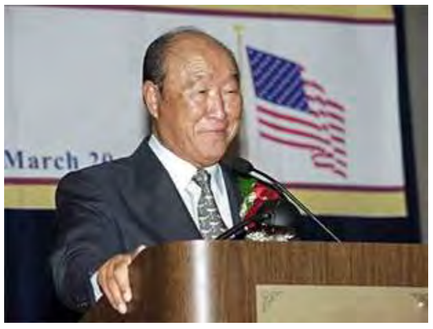
February 25, 2001 "We Will Stand in Oneness" Speaking Tour Begins

products that accommodate various religions and cultures.