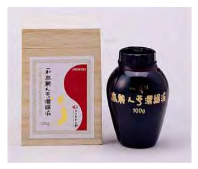
February 24, 2014 Ilhwa Ginseng Products Receive Kosher Certification

On February 24, 2014, Tongil Group's subsidiary company Ilhwa received the kosher certification. The two products that received this certification were the hydrolysis concentrate and the ginseng concentrate.