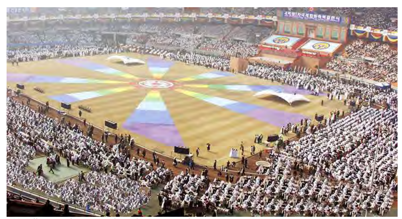
400 million couples receive the Holy Marriage Blessing.