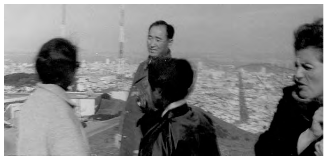
True Father established the first Holy Ground in the United States on Twin Peaks overlooking San Francisco

to Japan, departed ahead of them to prepare Americans for his visit.