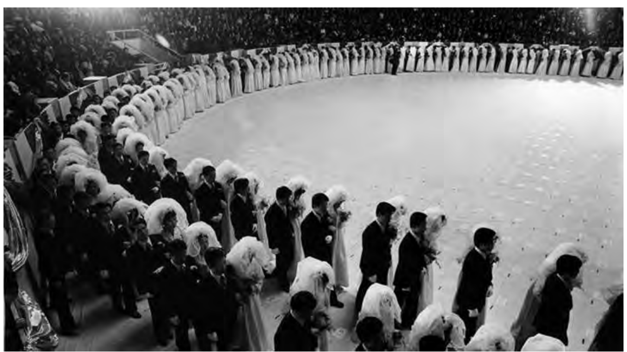
True Parents bless 1800 couples in marriage

February 8, 1975 1,800 Couple Holy Marriage Blessing