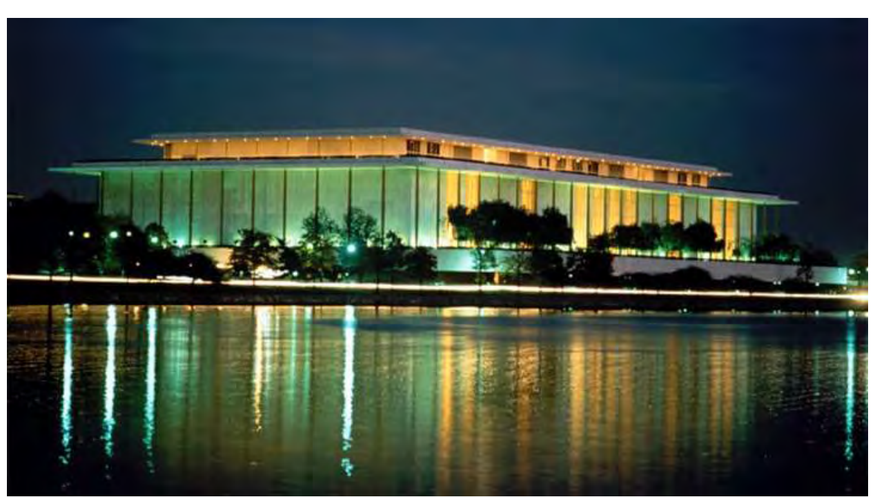
The Kennedy Center is where the Little Angels played the day they greeted True Father in Washington, D.C.

Having been denied visas on arriving in Los Angeles on December 11, 1971, because of alleged "communist affiliations," True Parents traveled to Toronto, Canada. There, due to the intervention of U.S.