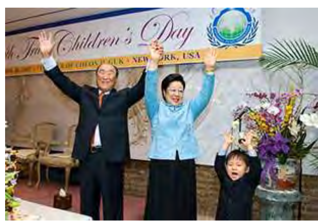
True Parents celebrate the 48th Children's Day and cheer with their grandson.

October 19, 1960 Children's Day Established