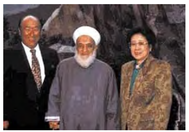
True Parents meet the Grand Mufti of Syria during the Middle East Peace Summit.

since the early 1980s. The Professors World Peace Academy (PWPA) and the Council for the World's Religions (CWR) had convened several conferences of high-level Muslim religious leaders, including the grand muftis of Syria and Yemen.