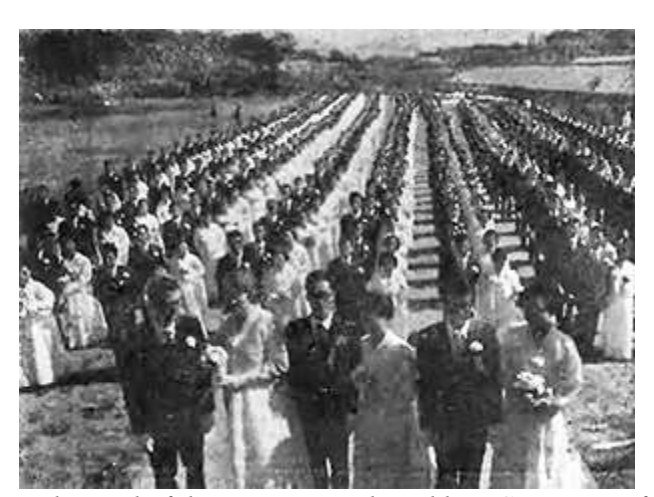
Rehearsal of the International Wedding Ceremony of 777 couples at Sutaek-Ri.

True Parents presided over the first truly international Holy Marriage Blessing when they blessed 777 couples on October 21, 1970. As part of the 430 Couples Holy Marriage Blessing in 1968, True Parents blessed 43 non-Korean couples overseas in 1969. For the 777 Couples Holy Marriage Blessing, participants came from 10 nations to Korea. The Marriage Blessing was conducted at Seoul's Changchung (Metropolitan) Gymnasium in the presence of over 15,000. True Father stated that this was the last Marriage Blessing that he would conduct "before globalizing my mission." He noted that the 777