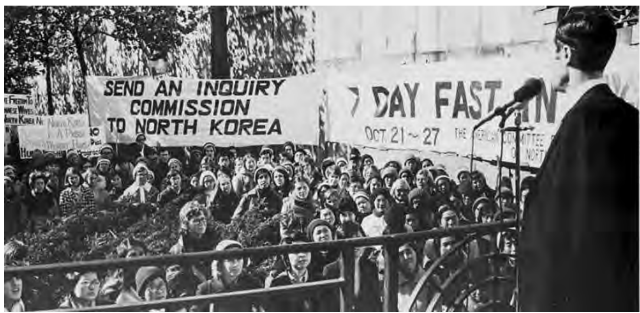
True Father speaks at the conclusion of the 7-day fast.