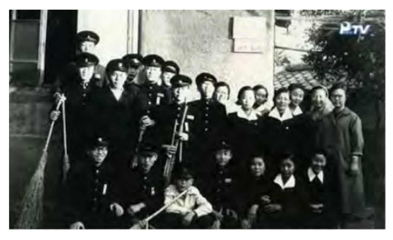
October 23, 1955 Establishment of the Seonghwa Student Council

The Seonghwa Student Council was founded on October 23, 1955. At the beginning of that month, True