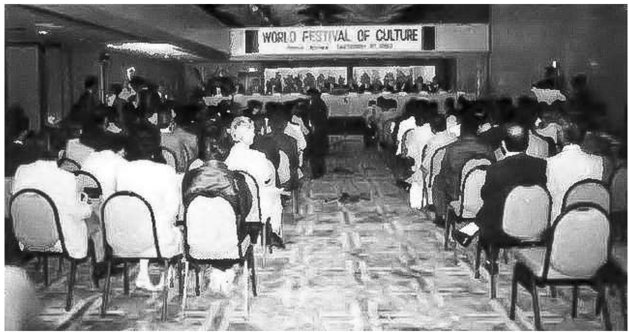
The press conference announcing the World Festival of Culture.

On September 14, 1999, True Father opened the era in which blessed families were no longer to pray in the name of True Parents or any mediator but in their own names as blessed couples who have inherited True Parents' realm of victory. True Father explained that this was meant to mark the era of "personal responsibility." He said that couples should "report their work" and that it was no longer "a time to pray to receive blessings." This guidance was consistent with True Father's view that humankind had entered the Completed Testament Age.