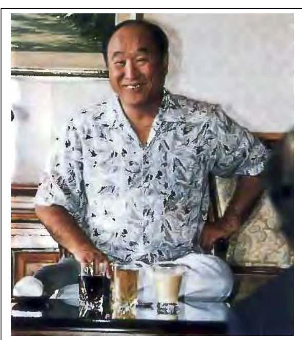
True Father welcomes the representatives of 120 nations to his home in Korea for the Seoul Olympics.

The Games of the XXIV Olympiad took place from September 17 to October 2, 1988, in Seoul. The "Seoul Olympics" were significant not only for Korea as the second Asian nation to host the Olympic Games but also for the world, as the games brought together athletes from the communist and free-world nations for the first time since 1976. These also were the last Olympic Games for the Soviet Union and East Germany, both of which would cease to exist by the time of the next Olympic Games in 1992.