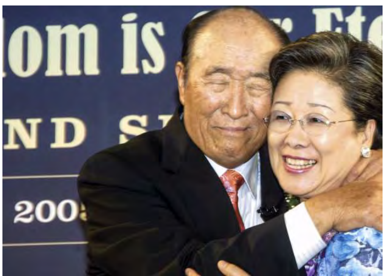
True Parents at the inauguration of the Universal Peace Federation on September 12, 2005.