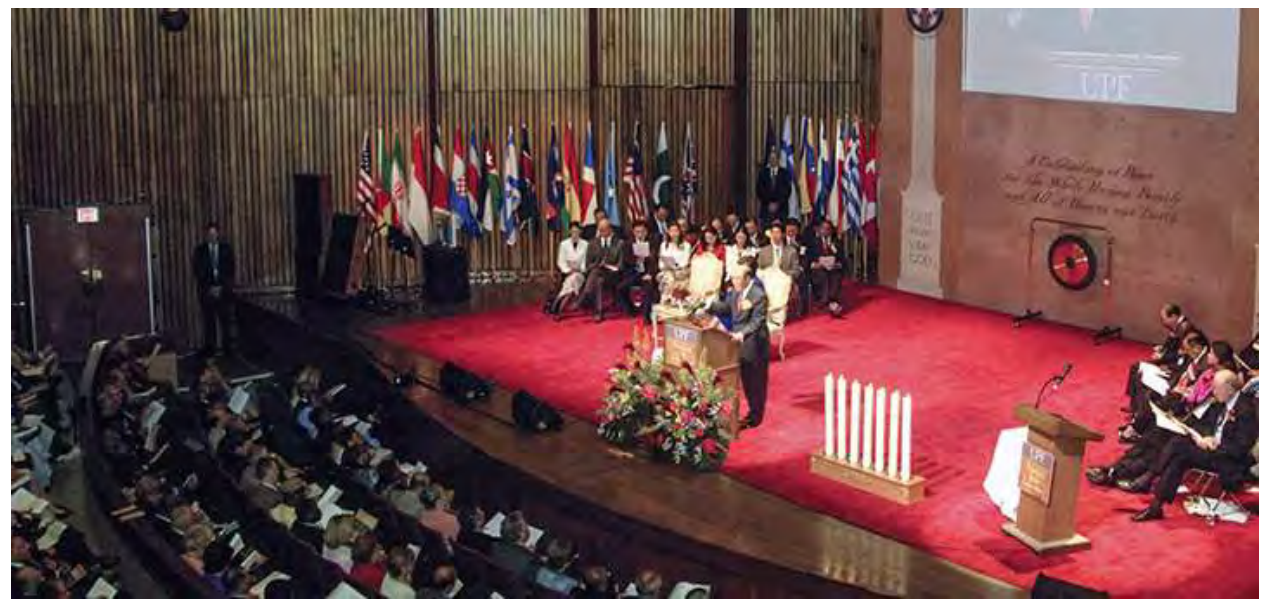
True Father speaks at the inauguration of the Universal Peace Federation on September 12, 2005.