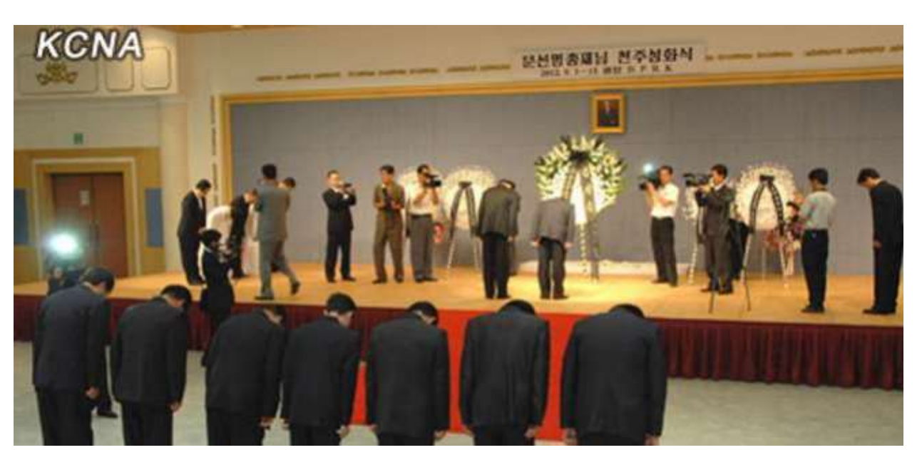
September 6, 2012 True Father Awarded National Reunification Prize from North Korea

The Presidium of the Supreme People's Assembly of the Democratic People's Republic of Korea (DPRK) on Sept. 6 conferred the National Reunification Prize posthumously upon True Father, as reported by the Korean Central News Agency (KCNA). "Moon positively contributed to realizing the nation's reconciliation and unity and the country's peaceful reunification and achieving the prosperity