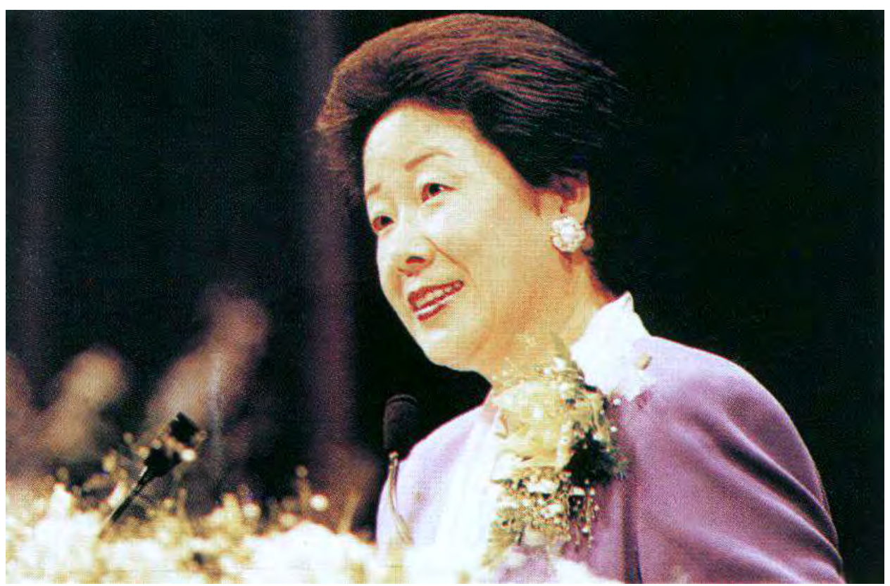
True Mother gives her address at the UN September 7, 1993.

True Mother delivered the speech "<u>True Parents and the Completed Testament Age</u>" [http://www.tparents.org/Moon-Talks/HakJaHanMoon/UH930500.htm] at the United Nations on September 7, 1993. This followed her delivery of the same speech at the U.S. Capitol on July 28 before representatives from 115 congressional offices and was the springboard to her world tour in which she