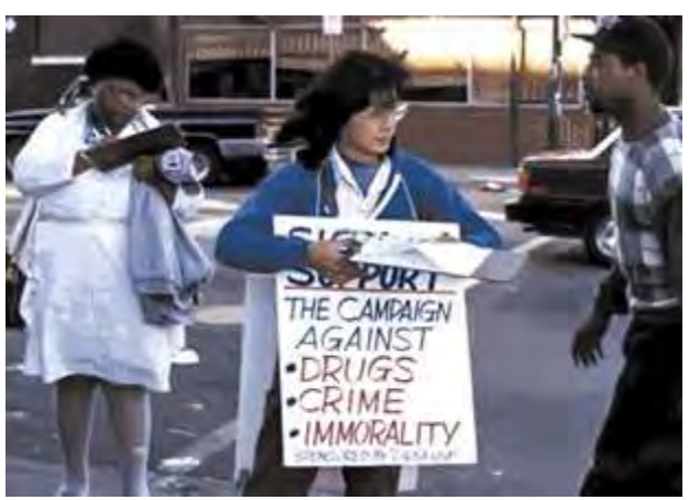
A woman collects signatures for CAUSA USA

True Father planned to conduct a Moscow rally by 1981, but this was prolonged for nearly a decade due to court battles in the United States and the need to build up a stronger church. Having concluded the "Danbury Course" and established a multifaceted presence in America by 1985, True Father mounted a march to Moscow from 1985 to 1990.