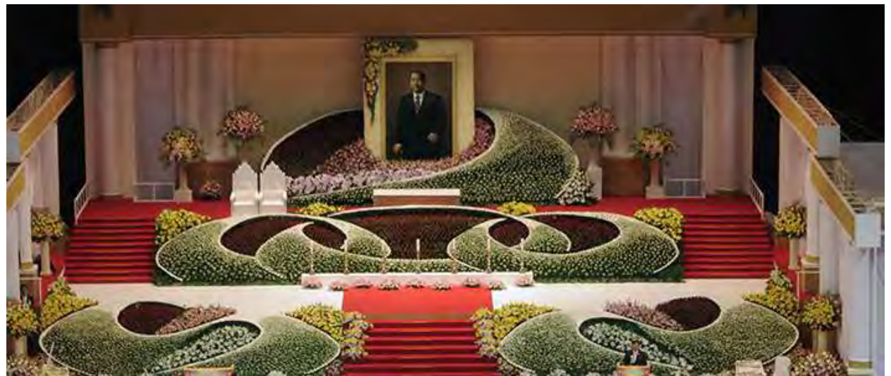
True Father ascended to the spirit world on September 3 2012 and his Seonghwa (ascension) ceremony was held in Korea.

September 3, 2012 True Father's Ascension