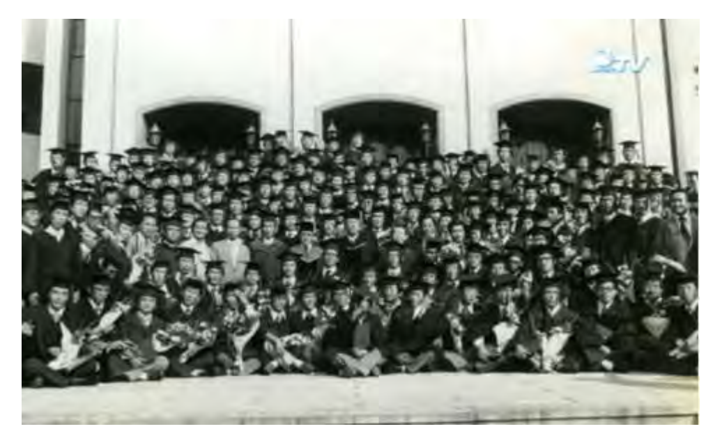
September 4, 1979 The Unification Theological School's First Graduation

On September 4, 1979, the Unification Theological School held its first graduation at the old church headquarters in Seoul. Around 600 people attended, and two students from the Department of Theology and 174 students from the Department of Divinity graduated. At this ceremony, the principal of the school encouraged the graduates to be shepherds that do not neglect to further explore the truth. The Unification Theology School is the birthplace for young pastors who then go on to study at the Sun Moon University Theological Department.