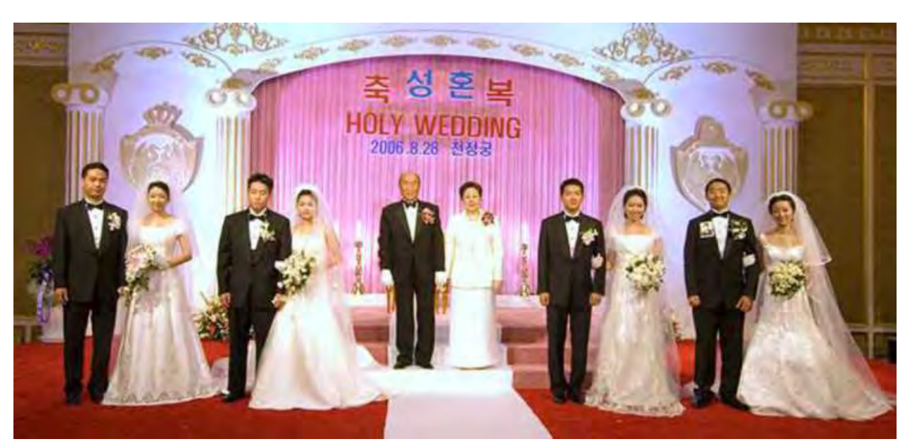
August 28, 2006 Holy Blessing of the Third Generation

True Parents officiated a Holy Wedding Ceremony for the third generation of Unificationists, which included some of their own grandchildren (seen on stage). On the foundation of True Parents' victory in realizing God's kingdom of a peaceful, ideal world, a Holy Wedding Ceremony was officiated by True Parents on August 28, 2006.