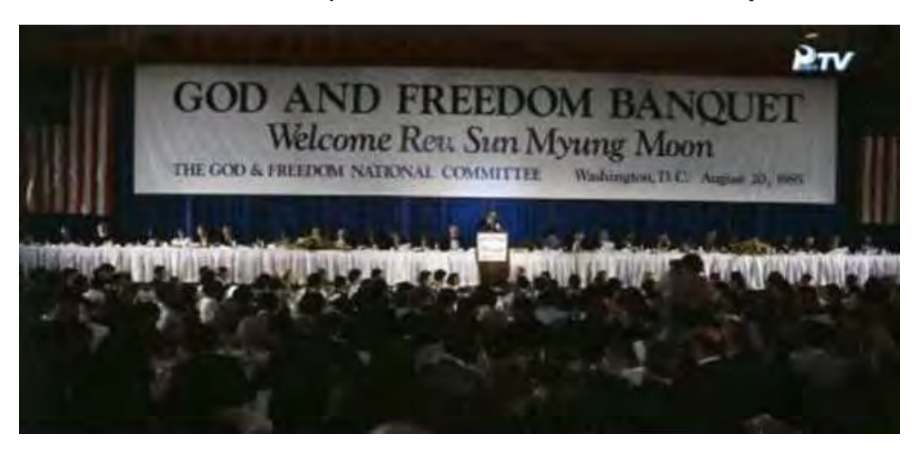
True Father's "Danbury Course" consisted of his indictment, trial, appeal and imprisonment on tax