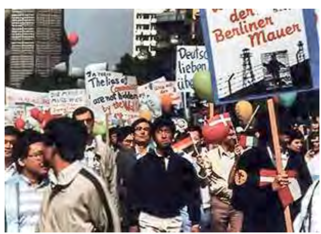
Hyo Jin Moon bravely leads 2,000 marchers on their way from the center of West Berlin to the Wall

World CARP held its Fourth World Convention in Berlin, Germany, from August 2 to 8, 1987, during the waning days of the Cold War. Opponents attempted to block the convention by denying CARP hotel and convention space. When those tactics failed, the leftist opposition resorted to heckling and shouting abuse at almost every event, throwing paint and stink bombs, slashing tires of 20 CARP vehicles and setting fire to a CARP bus. Nevertheless the convention was successful, with 3,000 people attending various events. The convention's high point was on its last day, when 2,000 CARP members and others marched 7 kilometers from the center of Berlin to the Wall near Checkpoint Charlie. In spite of the hazards, World CARP President Hyo Jin Moon insisted on walking at the front of the march.