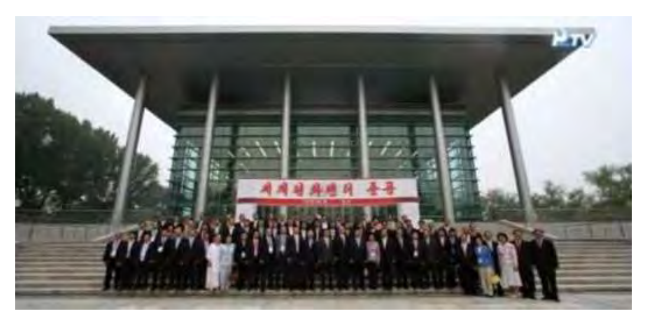
August 5, 2007 Completion Ceremony of the World Peace Center, Pyongyang, North Korea

In the wake of the peace movement initiated by True Parents, the completion ceremony for the World Peace Center in Pyongyang, North Korea, was held on August 5, 2007. FFWPU leaders came from South Korea, Japan and the United States to take part in this event, along with North Korean and South Korean dignitaries including the vice chairman and secretary general of the Chosun Committee for Peace in Asia and the Pacific.