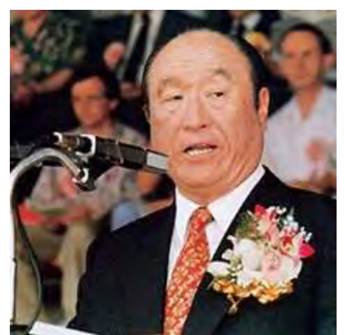
July 6, 1992 True Father Publicly Declares His Messiahship

True Father publicly declared his messiahship for the first time in a speech delivered to Women's Federation for World Peace (WFWP) and Korean civic leaders in Chungju, Korea. This was the first of four major gatherings that took place from July 6 to 9, 1992, in Korea's Seoul region, the southeast region, the southwest region and the mid-Korea region. In his speech, "The Reappearance of True Parents and the Ideal Family," [http://www.tparents.org/Moon-