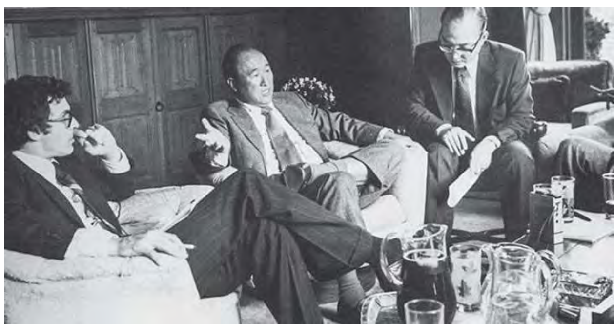
True Father being interviewed for the Newsweek magazine article.