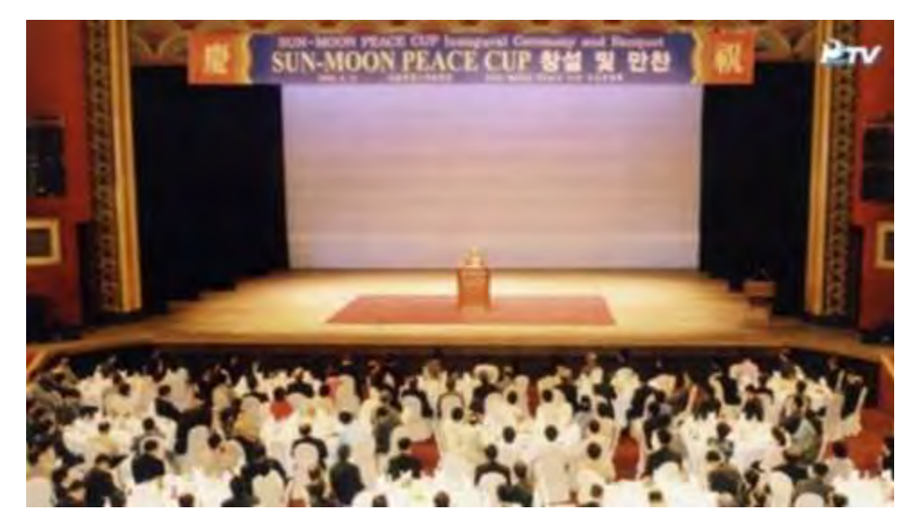
June 12, 2002 Sun Moon Peace Cup Inaugural Ceremony

The Sunmoon Peace Cup Inaugural Ceremony took place at 3 PM on June 12, 2002, at the Seoul Little Angels Arts Center.