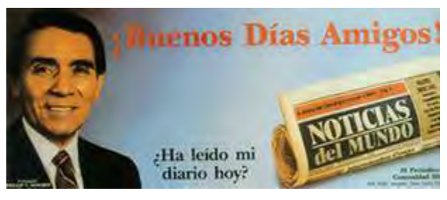
April 22, 1980 Noticias del Mundo Established

True Father founded the Spanish-language newspaper Noticias del Mundo on April 22, 1980, as an effort to begin a relationship with the Hispanic community in the United States and Latin America that would help turn the tide against communist infiltration of the Western Hemisphere. Earlier, True Father set up the anti-communist educational organization CAUSA and sent Dr. Bo