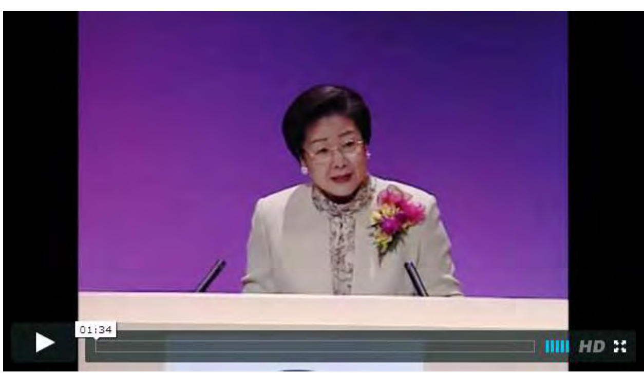
True Mother speaks at the Manhattan Center in New York during her American speaking tour, while True Father participates at East Garden as part of his condition to support True Mother's leadership

True Mother embarked on a 16-city speaking tour from April 1-16, 1998 under the banner: "Blessed Marriage and Eternal Life". She spoke in Chicago, Dallas, Boston, St. Louis, Oakland, Atlanta, Washington D.C., Bridgeport, Richmond, Louisville, Manhattan, Seattle, Los Angeles, Denver, Minneapolis and Toronto. At each stop, Unificationists gathered with True Father at East Garden in Tarrytown, NY, listening to True Mother's address via live feed.