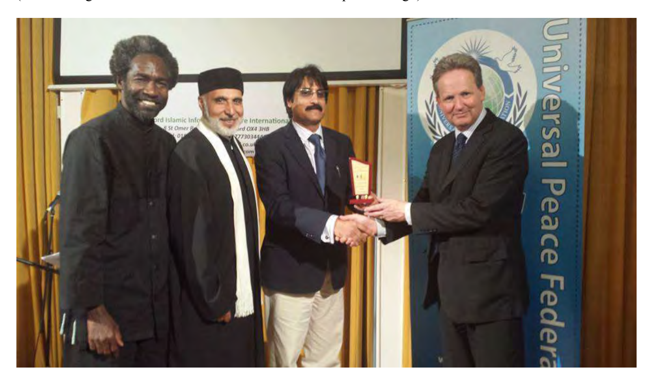
VENUE : High Commission of the Republic of Mozambique, Fitzroy St, London W1T 6EL,

(Former Anglican Primate of All Ireland and Archbishop of Armagh)