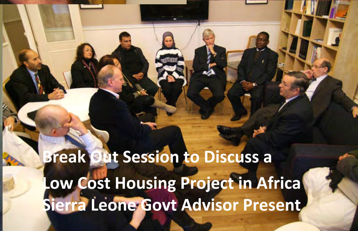
Break Out Session to Discuss a Low Cost Housing Project in Africa Sierra Leone Govt Advisor Present