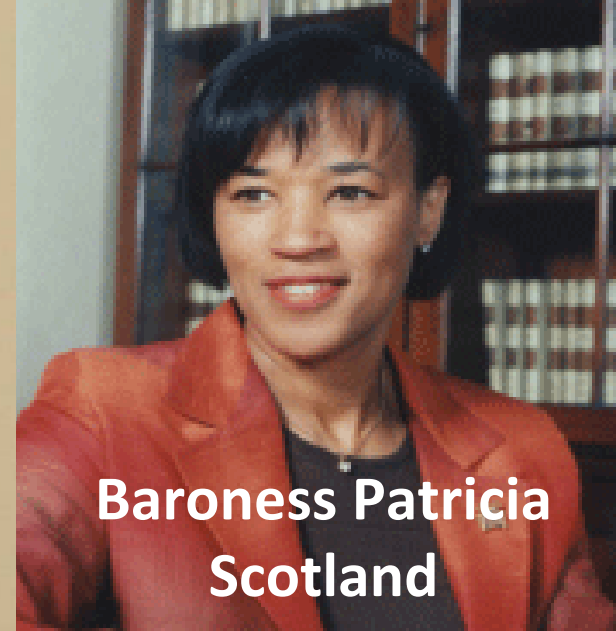
Baroness Patricia Scotland