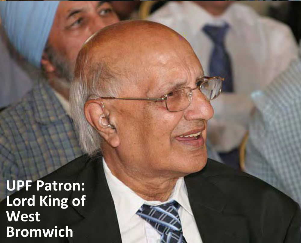
UPF Patron: Lord King of West Bromwich