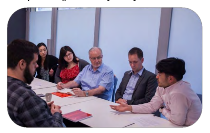
Lively discussion during the networking session.

In the afternoon, participants joined various breakout sessions that included workshops and presentations on the following themes: 'culture of change' and