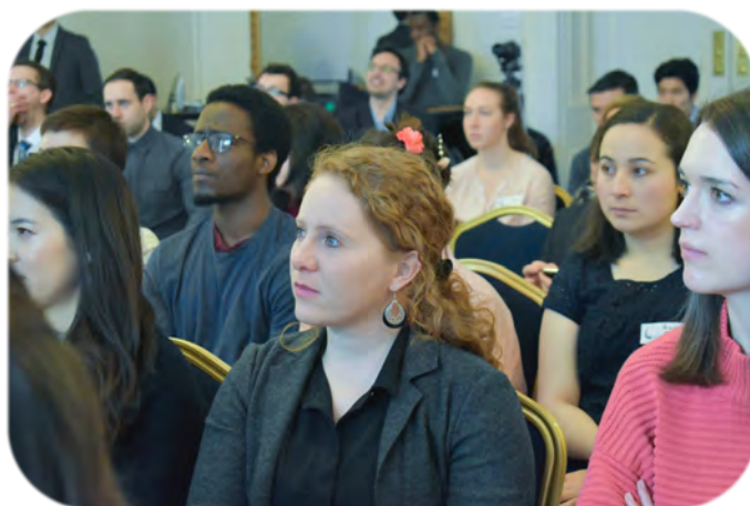
Audience members listening to Keynote speakers