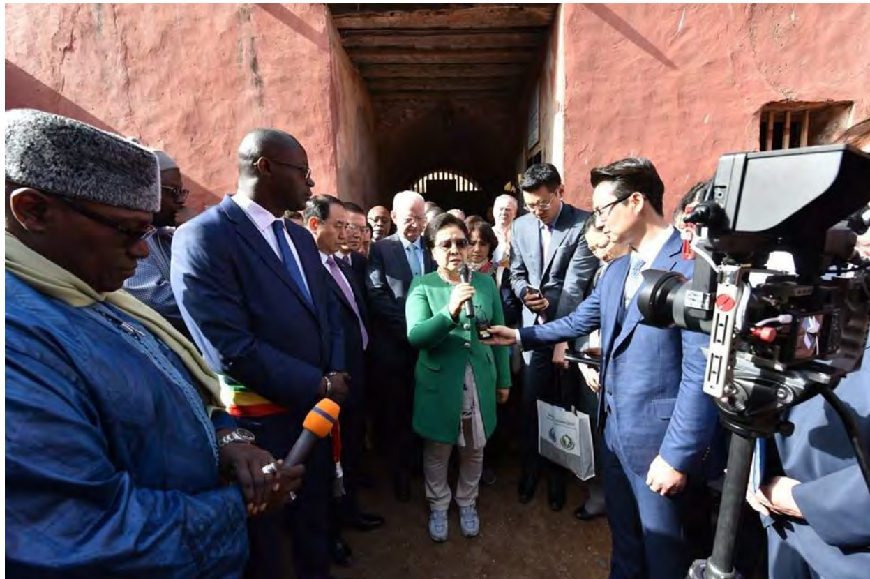
Mother Moon offers a prayer for the victims of slavery at Gorée Island (2018)

What does it mean to live with God? Mother Cabrini, Jesus Christ, Dr. Hak Ja Han Moon, and Reverend Sun Myung Moon are four examples of lives lived in service and sacrifice for God. From nations, countries, and communities, these individuals are recognized for their authentic relationship with God and how they lived it. They teach us that living with God also means living while connecting to the vision God has for us and the world. Living with God means giving.