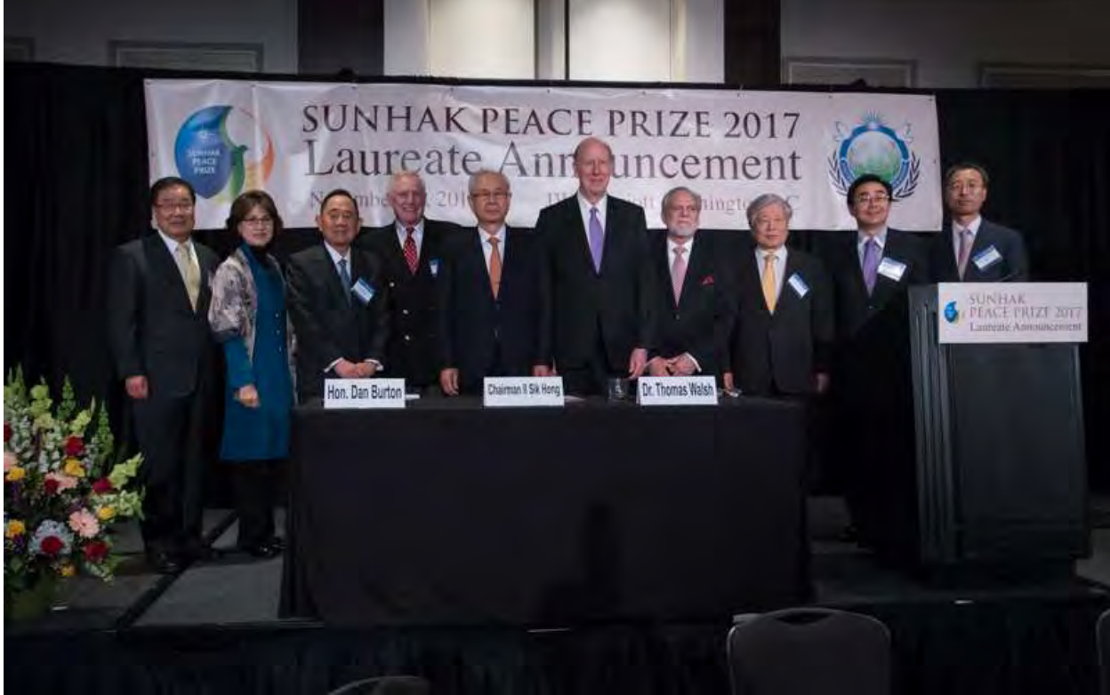
Members of the Sunhak Peace Prize Foundation