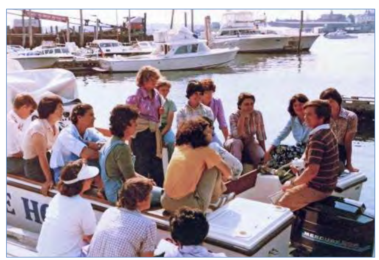
The fleet engineer gives a lecture on the outboard operation and maintenance to the sisters who are preparing for the all-sisters boat.

The hardest job was selecting the four sisters to be on the all-sister's boat. All of them had good qualities, but none was skilled in all aspects. I had to put together a team that would cover all the bases. One was a good navigator, and another understood the gear. The third was a black belt in tae kwon do and had the strength to handle a tuna. The captain, however, wasn't the best in any of these skills. What she was endowed with was a mother's heart. The key to the success of this boat would be teamwork, and the captain must be able to bring the individuals together into one cohesive unit. Only a mother's heart could accomplish that.