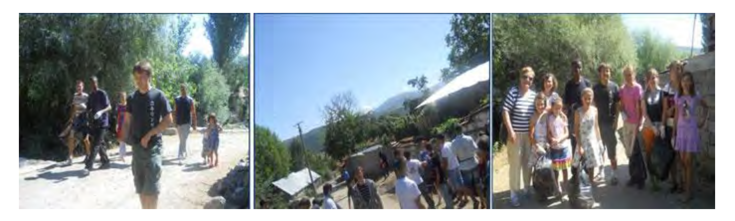
We'd like to thank the team from London and all the brothers and sisters who joined in these activities and we wish that God's blessings can be with you and your communities.