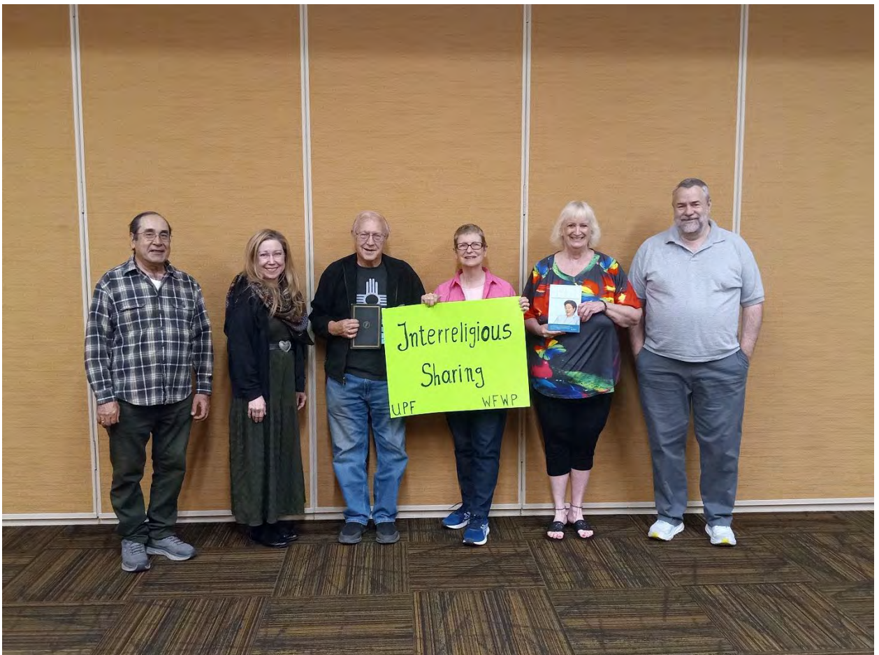
On October 24th, we held our monthly Interreligious Sharing program at the public library. Our theme was, "What Inspires you about Your Faith, Religion or